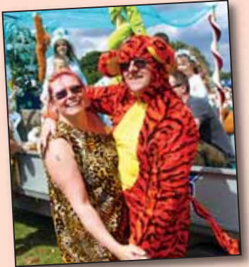
Dancing to the Samba rhythm

01883 346641 www.caterham-independent.co.uk