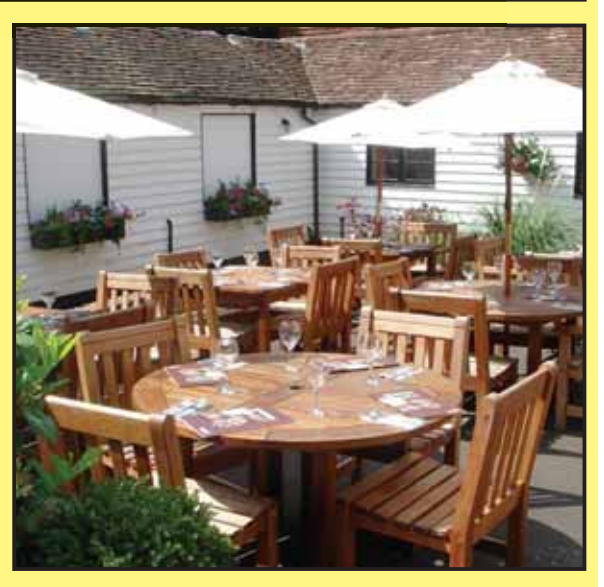
The White Hart, Godstone

course daytime set menu cost? a) £7.99 b) £9.99 c) £11.99