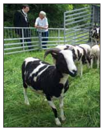
Sheep play a vital role in protecting rare chalk-loving plants at Happy Valley

The new Downlands Circular Walk board displays long and short versions of the walk, with some information about the wildlife and history of the area. A new version of the Circular Walk leaflet is now available from the Downlands Project on 01737 737700.