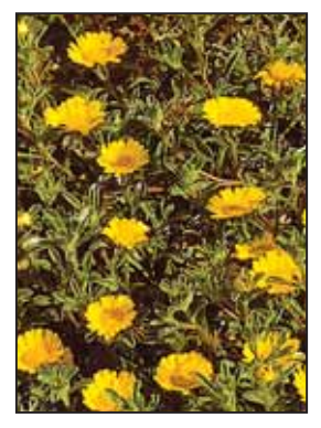
The Astericus will provide colour throughout summer in a dry, sunny plot.

The type of soil is important. Acid soils found in areas of high rainfall or under tall conifers where their needles fall are essential for camellias,