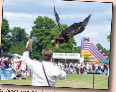
At least the eagle returned to his trainer

high during the first demonstration, he lost his bearings and failed to return. The crowd were reassured that he would eventually be recovered, thanks to a tracking device attached to his leg. Last year's event raised £6,000 for local organisations and the Carnival Committee is confident the figure will be even higher this year, when it is announced at the AGM in September.