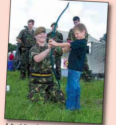
A budding Robin Hood gets to grips with archery