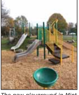
The new playground in Mint Walk, Warlingham.

Playground Bletchingley Friends raised just over £35,000 towards the Grange Meadow project, while £50,000 was provided by the Playbuilder scheme. Playground Bletchingley Friends, a group of local parents and individuals, raised the money by organising sponsored swims and fetes, as well as attracting £8,500 from the Rural Ac-