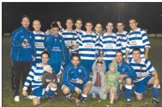
Caterham Old Boys FC - Redhill and District League 2008/9 Senior Cup Winners.

Caterham Old Boys Football Club have just completed the most successful season in the club's history, with the first team winning the Redhill & District Football League Premier Division and the Senior Cup. The reserves were runners-up in the Redhill & District Football League Fifth Division, as well as winning the Junior Cup. Both cup finals were played under floodlights at the Redhill FC ground, and the reserves would probably have won the league if they had started their run of wins one game earlier. They finished the season on the back of a run of 16 straight wins in all competitions. The reserves were also the only side in the Redhill and District League both Saturdays and Sundays who scored more than 100 goals for the season in league