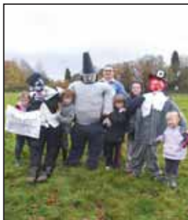
Last year's winners of the Build a Guy competition.

As we get closer to November, the mysterious pile of wood in the Dene Field next to the Dene Hospital in Caterham-on-the-Hill will increase in size ready to become a huge bonfire on Saturday 7th November, the date of this year's Round Table Fireworks Night. The torchlight procession will leave Westway Common at 6.30pm and the bonfire will be lit at about 7pm. Hot food will be available in the Dene Field with the local scouts manning a hot dog and hamburger stall. Admission is £5 on the night or £4 in advance. Tickets are available up to and including the 6th November from Cost Cutters Westway, Butlers, High Street, Caterham-on-the-Hill and J.J. Browne Jewellers, Godstone Road, Caterham Valley. For the third year, the Round Table are inviting local youngsters to make a spectacular Guy Fawkes to put on top of the huge bonfire.