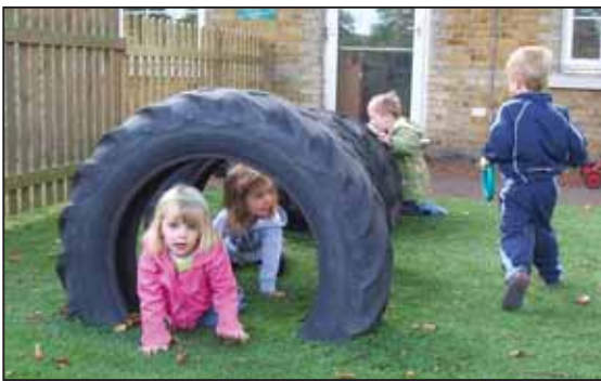
Having fun in the new outdoor play area

wonderful new outdoor play area situated on the green. Little Treasures operates from 7.30am - 6.00pm Monday to Friday. Registration will be free for anyone registering for a nursery or pre-school place on the Fun Day. Any profits from the day will go to a little boy in Niger who is sponsored by the nursery through World Vision.