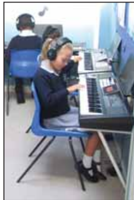
A young pupil from Warlingham Park School learns her way around one of the brand new Roland E9 keyboards

This term sees the opening of the new keyboard lab at Warlingham Park School, consisting of six Roland E9 keyboards and accessories kindly donated by the Friends of Warlingham Park School. The special keyboard lab has been constructed for every child in the school to enjoy. The keyboards have great sound and recording features to enhance the children's learning and can also be used with the school's laptops to create music.