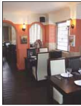
The stylish interior of 'La Botija'.