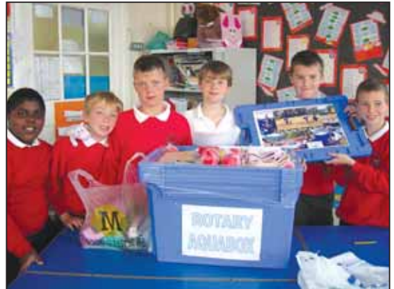
Hillcroft School pupils with one of the life-saving Aquaboxes

Hillcroft Primary School recently completed the filling of two Aquaboxes provided by the Caterham Rotary Club. The boxes have been sent to a central depot ready to be sent out whenever a disaster strikes somewhere in the world. Each Aquabox is a robust plastic tank packed with welfare items for a disaster situation. Once the welfare contents have been removed for use each Aquabox can then be used