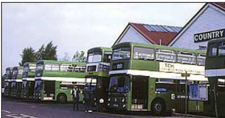
London Country Leyland Atlantean's on the forecourt of Chelsham Bus Garage.

The tribute website to Chelsham Bus Garage can be viewed at www.chelsham-garage.co.uk