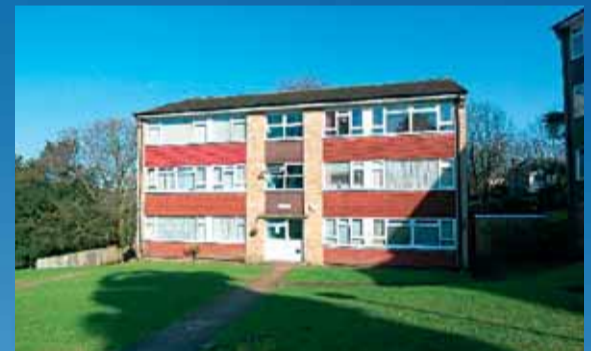
Caterham Valley - £179,950 WELL PRESENTED

A two bedroom ground floor maisonette with kitchen with utility area, off street parking, own front garden and conveniently located for local shopping.