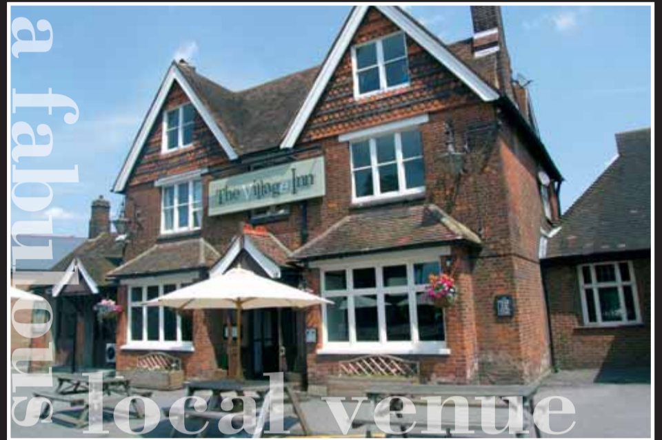
a favourite local venue