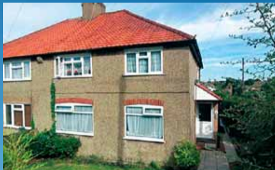
Caterham on the Hill - £169,950 MODERNISED & TASTEFUL DECOR

A detached three bedroom family home with level gardens located in a popular residential location and offered, in our opinion, in good decorative order.