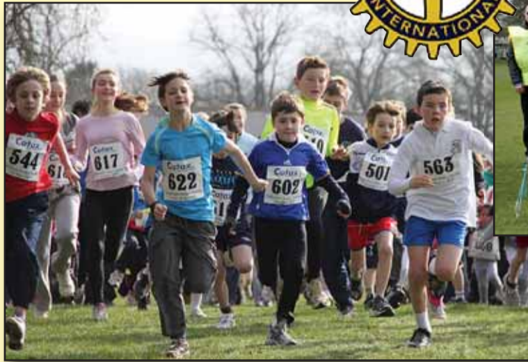
Setting off on the 1k Fun Run