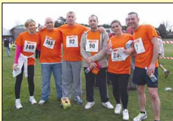
The Ross Cycles team