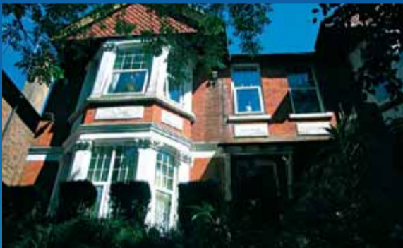
Caterham Valley - £174,950 CHARACTER PROPERTY

A two double bedroom flat located less than a third of a mile from Caterham Town Centre and railway station with its own rear garden and set in a wooded valley. Ideal purchase for investment or first time buyer.