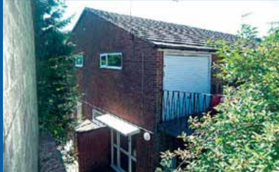
Caterham Valley - £250,000 GARAGE & OSP

A four bed town house built in 2006 set in a select private development. Benefits include cloakroom, ensuite to the master bedroom and South facing garden.