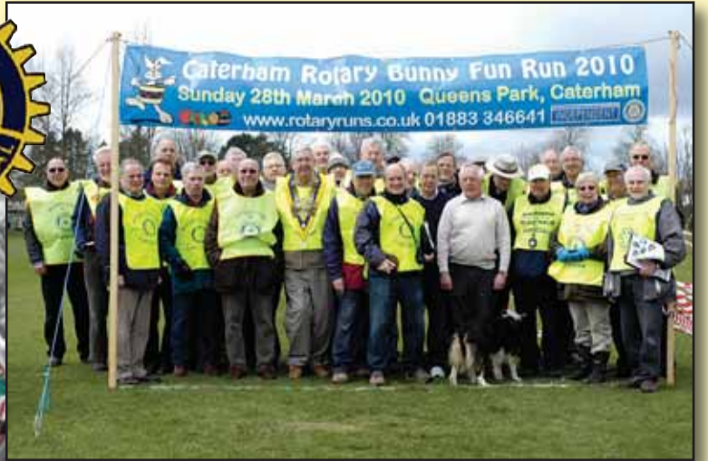
Members of Caterham Rotary Club, organisers of the Bunny Fun Run.