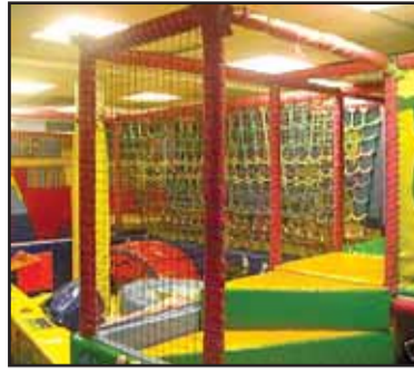
The soft play area in 'The ARC'

share issue has already raised enough money to get The ARC back on its feet and anyone who has visited recently will have seen how the sale of more shares enabled us to complete an extra section of the main play frame since we first reopened. If we sell more shares now, we can make The ARC even better for everyone and ensure that it becomes self-sustaining in the future." The centre has been busy since its relaunch in February. However, it has relied heavily on its army of volunteers who are helping to keep the complex running until it raises enough money to cover its costs on an ongoing basis.