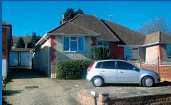
Caterham on the Hill - £234,950 CUL DE SAC LOCATION

A ground floor one/two bedroom apartment in close proximity to Town Centre and Railway Station. Own rear garden, long lease and no onward chain.