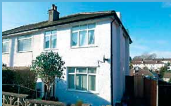
Caterham on the Hill - £244,950 NEWLY MODERNISED

A two double bedroom end of terrace house with two reception rooms, modern kitchen, OSP and rear gardens in excess of 70'. Viewing Recommended.