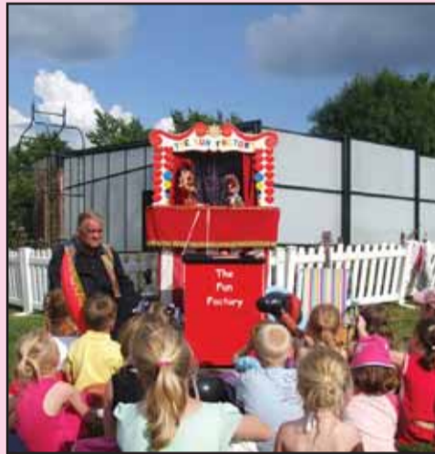
A Punch and Judy show provided some lively children's entertainment