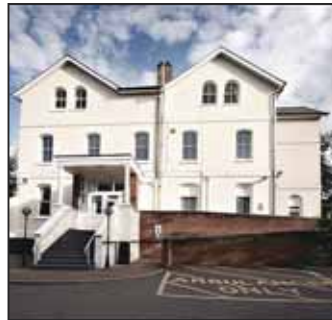
North Downs Hospital, Caterham.