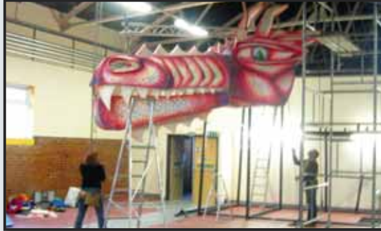
The massive dragon's head is carefully raised up into the roof space.

Dick Moran, Chief Executive of the CBCT says: "Like any share scheme, there is a risk that, at worst, investors might not get their money back. The difference here is that if we all come together and each put in a bit, we could get back a wonderful facility that we can all enjoy for decades - that's surely a better bet than putting your money into a bank, especially these days!"