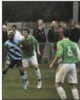
Match action against Fleet

In the Surrey Senior Cup we continued this form and conceded in the 93rd minute to lose 3-2 away to Walton and Hersham, who we had drawn with just a week earlier in the league. One bright moment was a 2-1 win away to Corinthian Casuals. Whyteleafe had led for most of the game, but the Casuals equalized with