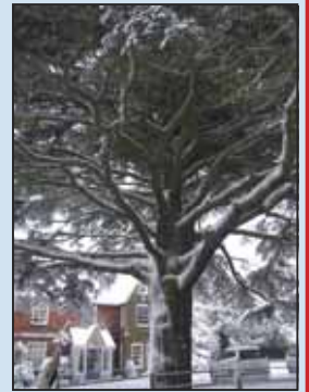
The cedar tree in the High Street, Caterham.

Then in Queen Victoria's reign, Into the Valley came the train, But for a time folks still relied, On horse and cab to complete their ride.