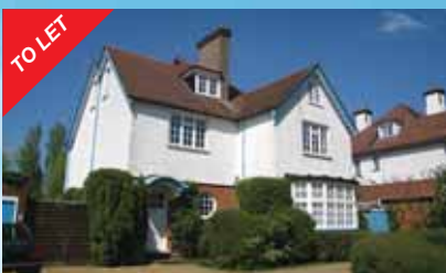
Caterham on the Hill - £650 PCM One bedroom conversion flat

Popular location, cottage style kitchen, lounge and garden room, half a mile from village centre.