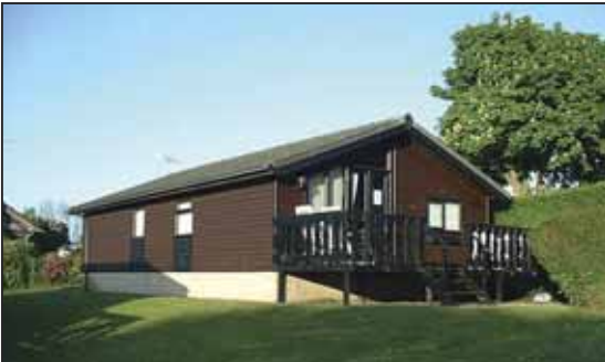
The charity's recently purchased second holiday home, T.J.'s Lodge in New Milton, Hampshire.