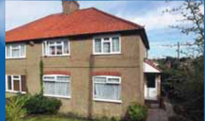
Caterham on the Hill - £169,950 Two bed ground floor maisonette

Ground floor, Victorian Conversion, own rear garden, adaptable accom, approx 800 sq ft!