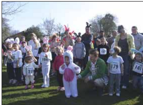
Bunnies line up for last year's 1km Fun Run

Preparations are well under way for the third, annual Rotary Bunny Fun Run which will set off from Queen's Park, Caterham-on-the-Hill on Sunday 28th March. As well as the 1km Fun Run there will be a 5km race for the more serious runners, which takes the runners out of the park and around a route covering Caterham-on-the-Hill and Chaldon, before returning to the park. The Caterham and District Independent is sponsoring the event as well as other local businesses -