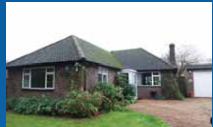
Chaldon - £375,000 Large two bed detached bungalow

Call us for a Free Valuation of your home