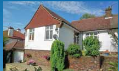
Old Coulsdon - £290,000 Two double bedroom semi bungalow

Requiring some modernisation, Lounge/Dining Room with views to garden and 'Farthing Downs'.