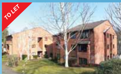
Kenley - £750 PCM Top floor two double bed flat

Well presented, lounge with fireplace, kitchen with appliances, occasional room, available now!