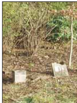
The gravestones now visible at the St. Lawrence's Hospital burial site.