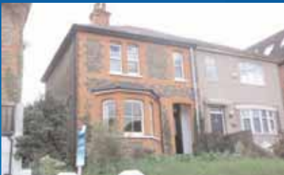
Caterham Valley - £279,950 Three double bed semi

Immaculately presented, tasteful decor, modern kitchen and bathroom, viewing recommended!