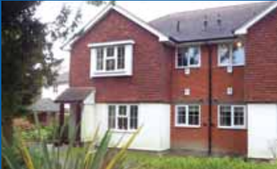
Caterham on the Hill - £169,950 One bedroom first floor maisonette

Old Coulsdon 01737 551188 • Caterham on the Hill 01883 348035 • Lettings 01883 343355