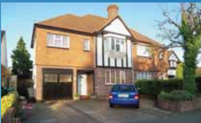
Old Coulsdon - £350,000 Tudor style four bed semi detached

Semi rural location, secluded plot, Living Room, Sun Lounge, Conservatory, Double Garage.