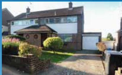
Old Coulsdon - £315,000 Three bed semi, good location

Located in the 'Heart' of Old Coulsdon, ensuite and bathroom, two receptions, landscaped gardens.