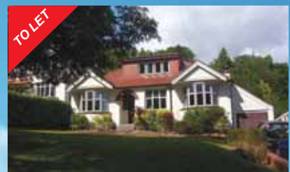
Whyteleafe - £1595 PCM Semi rural, detached five beds

Located within a mile of Kenley Station, part/unfurnished, available end of Jan 2010.