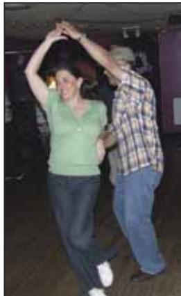
Last month at The Swing Joint