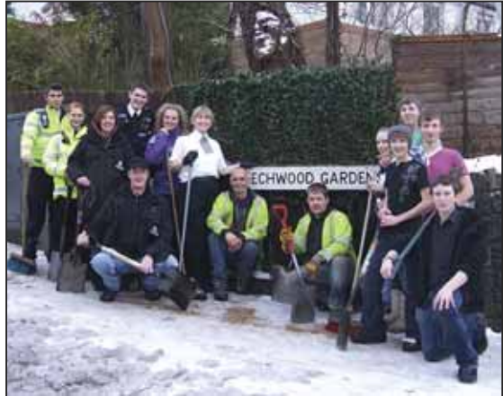
Members of Tandridge's Safer Neighbourhood Team with residents of Beechwood Gardens, Caterham.

Community spirit gets things moving during recent freeze - See page 2