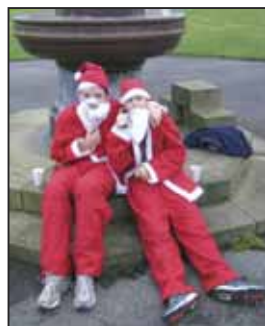
Two scout 'Santas' rest by the drinking fountain after the run