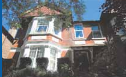
Caterham Valley - £174,950 One/two bed garden maisonette

Desirable, modern, kitchen with appliances, wardrobes, parking space, ideal first time buy!