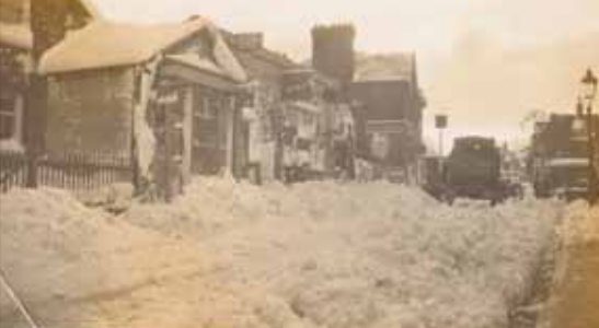
This photograph taken during the winter of 1946-47 was posted on the Caterham Facebook page by Caterham resident, Clare Addison. It shows the road outside 33 High Street, Caterham-on-the-Hill before the days of high-powered snow ploughs and gritting lorries.

High Praise for 'Creative Communities' project