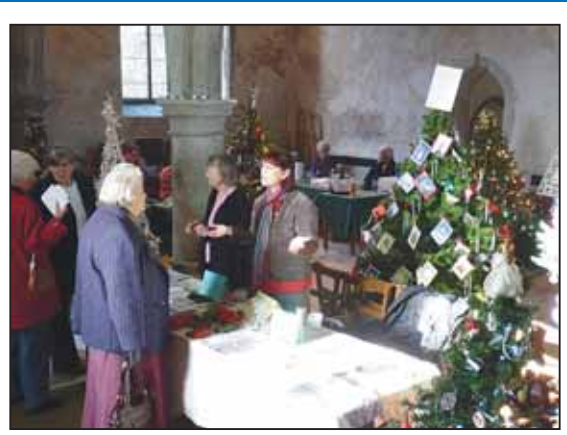
Inside St. Lawrence's Ancient Church.