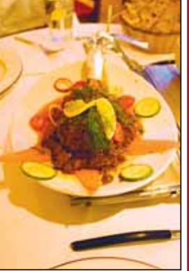
The Nalli Rogan Josh.