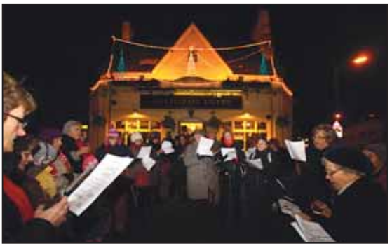
Carol singers outside the Whyteleafe Tavern

The Association was set up in the spring to raise the profile of Whyteleafe and its businesses and enable networking amongst its members. More information is available at www.whyteleafebusinessassociation.co.uk, including a link to the association's first newsletter.