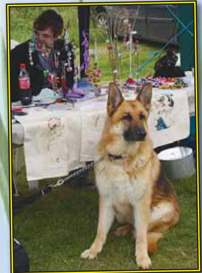
A trusty Alsatian helps to man the jewellery stall.