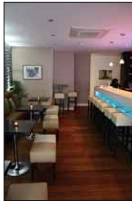
The stylish new bar at ID.