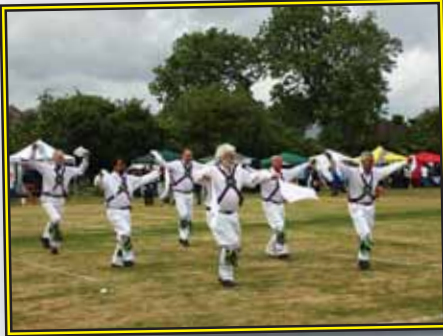
The Morris Men entertain the crowd.