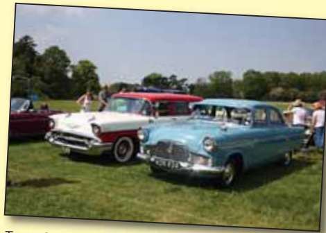
Two of the classic cars that took part in Sunday's cruise.

The Caterham Festival kicked off on 26th and 27th May with DeFest at de Stafford School in Caterham. The two day music event was blessed with sunshine this year, much to the relief of the organisers. Day one featured local rock bands and soloists, many of them performing live for the first time in front of their delighted fans. Day two had a forties theme starting with a classic car cruise around Caterham followed by live swing music and dance - perfect for a sunny Sunday afternoon!