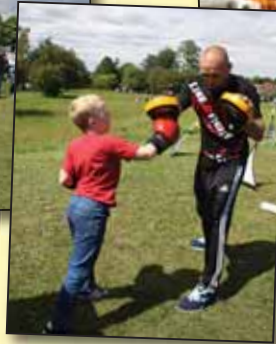
A youngster tries his hand at boxing with a member of 'Lke2Fight' boxing club.