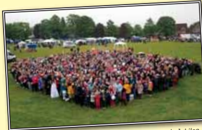
An estimated 4,000 people took part in the Queen's Jubilee Picnic on Waringham's School Common on 4th June, with more than 1,000 people taking part in a diamond shaped mass photograph. To order prints of the photo at just £5 each call 01883 623025..