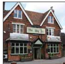
The Village Inn

The Village Inn in Coulsdon Road, Caterham-on-the-Hill, is making a fresh start following the review of its license on Monday, 18th June to tackle the crime and anti-social behaviour associated with the pub in recent years. The new restrictions on the license mean that drinks will not be served after 11pm, seven days a week; the pub must display 'Zero Tolerance Drugs Policy' signs; there must be hourly searches of the toilets to check for drug misuse and a license holder must be on the premises at