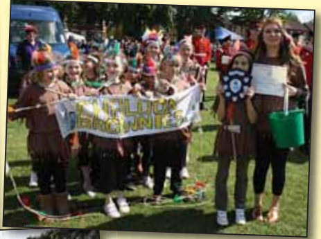
The Chaldon Brownies, First Prize winners of the Carnival procession.