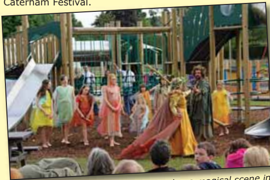
Oberon, Titania and the Fairies creating a magical scene in the playground at Queen's Park.

The Open Caterham weekend on 16th and 17th June saw many local venues putting on special events to raise their profile and celebrate the Caterham Festival. Sports clubs including the Caterham Bowls Club (pictured right) held taster sessions for the public and there was even an archaeological dig in Queen's Park which unearthed a piece of Roman pottery!