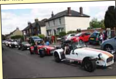
A convoy of seven Caterham Sevens took part in the carnival procession this year.