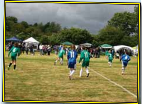
Warlingham v. Hamsey Green FC.

The event was a great success, despite the constant threat of rain which luckily held off for most of the day!