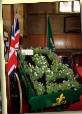
A vintage cart, recently renovated by Caterham Scouts had its first outing when it formed one of the eye-catching exhibits at the St. John's Church Flower Festival.