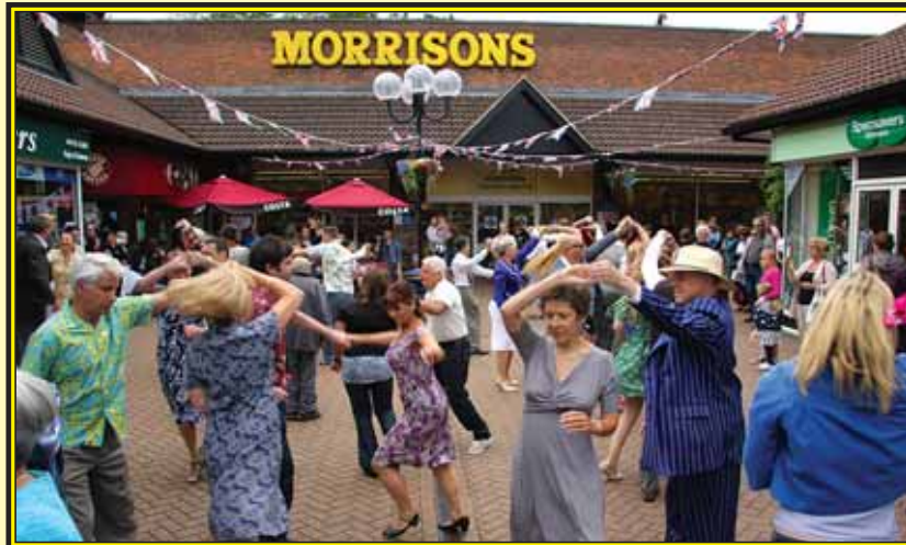
The Swing Jive 'flash mob' in Church Walk, Caterham on Saturday 23rd June. www.localeventphotos.co.uk