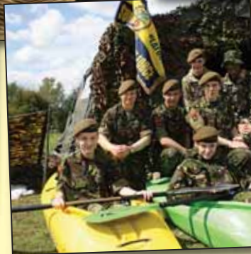
Caterham Army Cadets.