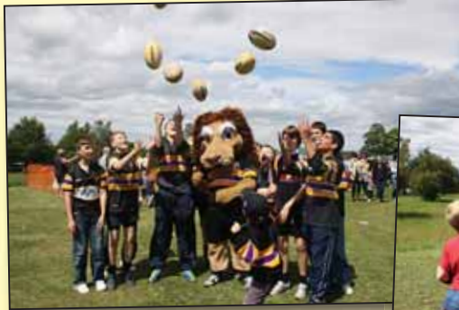
The Old Cats Under 12s Rugby team with their mascot.