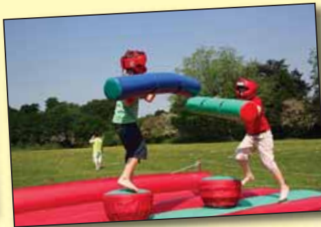
Kids let off steam at DeFest.