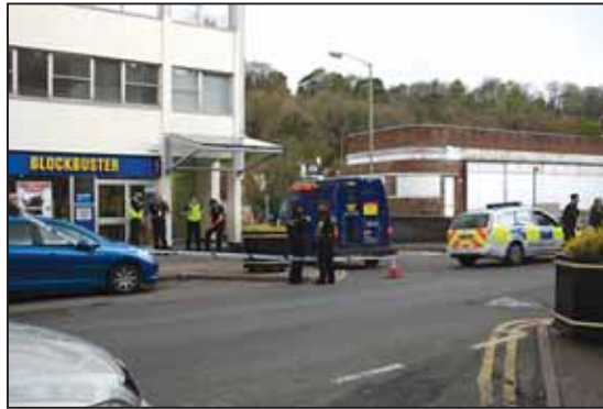
The scene outside Blockbuster in Croydon Road following the armed robbery.

A fourth man who was arrested was released on police bail while the investigation continues. He is due to answer bail on Saturday, 23rd June. The incident took place just before 12pm outside the Blockbuster store when a cash delivery driver was threatened with what is believed to be a firearm before