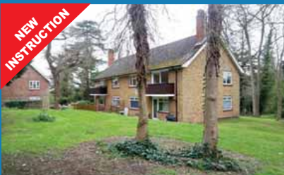
Kenley - £190,000 A two double bedroomed balcony flat just 400 yards from Kenley railway station and situated in a purpose-built cul-de-sac development with southerly views over delightful gardens. TO VIEW CALL 01737 551188

SPRING OFFER WE ARE OFFERING 1%+VAT ON ALL NEW INSTRUCTIONS THIS MONTH. PLEASE CALL FOR A VALUATION