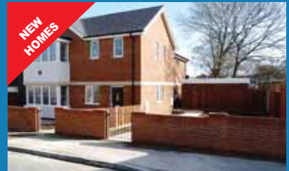
Caterham on the Hill - prices from £179,950 A choice of four one bedroom flats built by Buxton Homes. Constructed to a high standard with modern bathrooms and kitchens and quality floor coverings. STAMP DUTY PAID Subject to conditions. TO VIEW CALL 01883 348035

SPRING OFFER WE ARE OFFERING 1%+VAT ON ALL NEW INSTRUCTIONS THIS MONTH. PLEASE CALL FOR A VALUATION