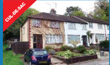
Whyteleafe - £245,000 An extended three bedroom semi-detached house located in a Cul de Sac and within walking distance to Whyteleafe South Railway station. Approximately 70' rear garden with storage unit and off street parking. TO VIEW CALL 01883 348035