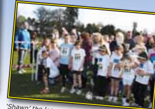
'Shawn' the lop-eared rabbit lines up at the start of the 1K Bunny Fun Run.