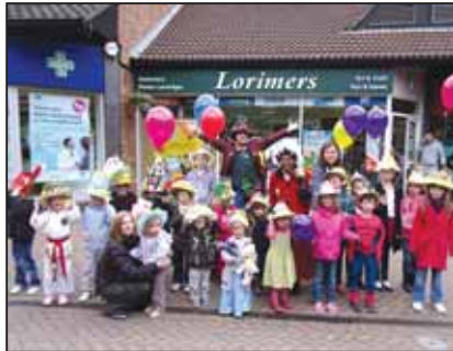
The Easter Bonnet Parade in Church Walk.