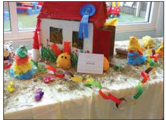
The colourful, Easter-themed table display by the Brownies.