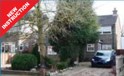
Caterham on the Hill - £429,950 A four bedroom detached family home with two receptions, kitchen and breakfast room, large south facing garden with workshop and shed and off street parking for several vehicles. Situated in a good location for local shopping and amenities. Viewing recommended. TO VIEW CALL 01883 348035

CATERHAM ON THE HILL 01883 348035 OLD COULSDON 01737 551188 LETTINGS 01883 343355