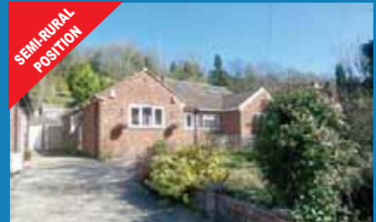
Old Coulsdon - £255,000 A two bedroomed semi-detached bungalow situated in a tree-lined, semi-rural road with bridle path access onto local common land, yet only a mile from the Village Centre. TO VIEW CALL 01737 551188