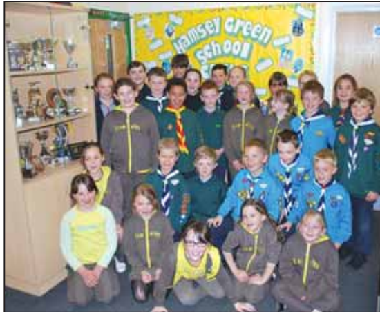
Pupils at Hamsey Green School in their uniforms.