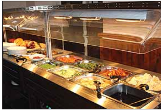
The new carvery bar at The Village Inn.

The food was of a very high standard, cooked by the restaurant's top chef and beautifully presented. I started with the Prawn and Smoked Salmon Cocktail and Mum had the Baked Camembert with Apple and Walnuts which she said was "lovely and soft and runny and nice to have the crispy nuts against