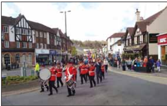
The St. George's Day Parade in Caterham Valley.