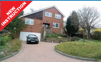
Old Coulsdon - £575,000 A spacious family home with many unusual features including a galleried reception room, a balconied master bedroom and secluded gardens, situated adjacent to protected woodland. TO VIEW CALL 01737 551188