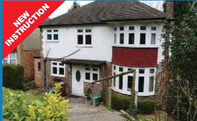
Whyteleafe - £399,950 A four bedroom detached family home located within half a mile of Whyteleafe and Upper Warringham Railway Stations with services into Croydon & London. The house has a large secluded garden, garage and off street parking. TO VIEW CALL 01883 348035