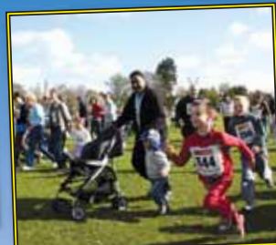
Runners set off on the 1K Fun Run.