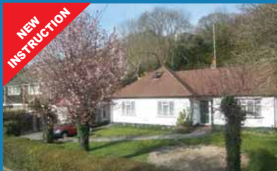
Old Coulsdon - £349,950 A three bedroomed detached chalet bungalow occupying an unusually wide plot with well-planned accommodation, located in a tree-lined semi-rural road. TO VIEW CALL 01737 551188