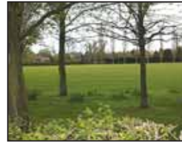
Grange Park, Old Coulsdon.

The Mayor of Croydon will be attending to plant an Oak tree to commemorate the Jubilee and a plaque will be installed next to a Horse Chestnut that was planted