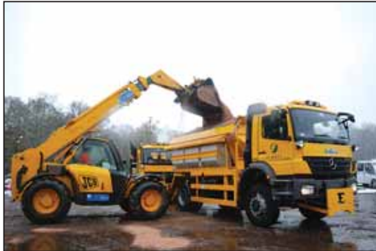
Surrey County Council's winter operation in action.

An army of 51 farmers will support the winter operation by clearing roads in more rural areas.