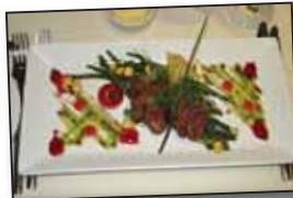
Honey roasted pigeon, hazelnuts and French bean salad.