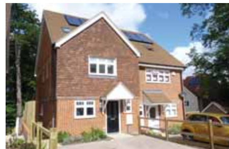
Caterham - £450,000

A brand new detached 4 bedroom house in a popular residential road and very convenient for local amenities and Warlingham school. 01883 622258