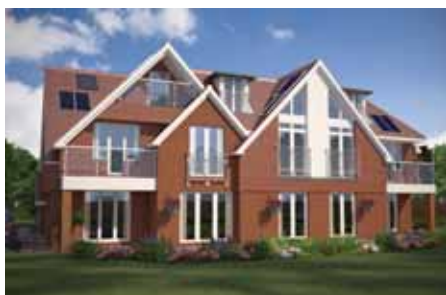
Warlingham – From: £369,950

4 Bedroom semi detached house. Spacious accommodation including 2 ensuite bathrooms and open plan kitchen dining room. Situated in a sought after development close to Caterham Valley 01883 347446