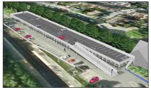
A computer-generated image of how Upper Warlingham Station car park will look with the new upper level.

The car park currently has 155 spaces and this number will increase to 245 in the New Year, thanks to the addition of 90 new spaces. An upper level to the existing car park will be constructed accessed by a single ramp. Andy explained how the traffic going up and down the ramp will be controlled by traffic lights that will be phased to meet the access and exit requirements at different times of the day. The groundworks are scheduled for commencement in December and will last for approximately two weeks. The installation of the tubular steel modules and Glass Reinforced Plastic panels that will make up the new car park level will