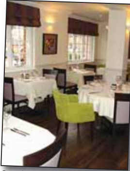
Inside the restaurant at 'Chez Vous'.

To finish we both had coffee with two miniature desserts, which was the perfect end to the meal. Chez Vous also does a lunchtime offer on Tuesdays to Saturdays - two lunch courses for £15. To book a table call 01883 620451.