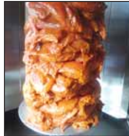
The chicken doner made from mildly spicy chicken breasts.