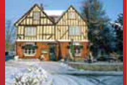
Large or small parties welcome. A la carte menu available.

Contact us for our Christmas brochure or visit our website www.godstonehotel.com