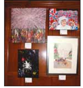
Paintings on the theme of 'Celebration'.

year's exhibition has been very successful. Our visitors have enjoyed the great variety of pictures and they like being able to have a cup of tea or coffee and a slice of cake while looking at the pictures. There has been a