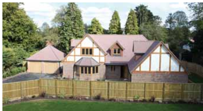
Warlingham – £1.6m and £1.35m

Two very spacious and beautifully appointed detached family houses each standing on a level plot in a much favoured residential area convenient for local amenities, railway stations and the M25. 01883 622258