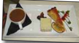
Coffee with miniature Pear Flan and Black Forest Gateaux garnished with fig, cherries and passionfruit.