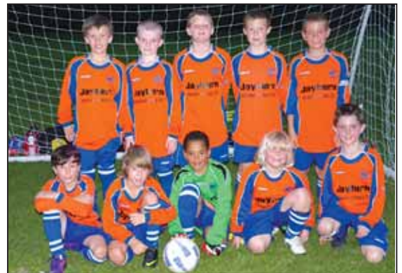
The Caterham Pumas Under 11 Boys Team.