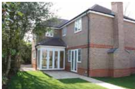
Warlingham – £435,000

A choice of 3 spacious apartments in a newly converted house. Private garden with ground floor apartment, very good residential position. 01883 622258