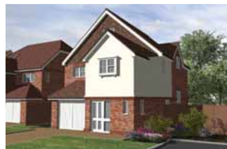
Caterham – £650,000

We have more new homes becoming available in the coming months. Please contact us if you wish to be informed of availability.