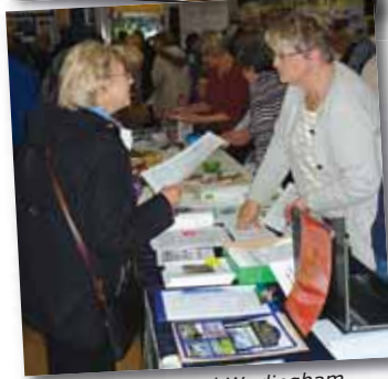
The visitors packed Warlingham Church Hall for the popular, free event.

been an excellent afternoon. The feedback is that everyone has found it really interesting." For more information about local history visit www.surreycc.gov.uk/surreyhistorycentre and www.exploringsurreyspast.org.uk