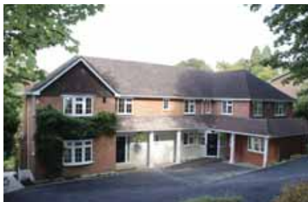
Warlingham – From: £369,500

Two very spacious and beautifully appointed detached family houses each standing on a level plot in a much favoured residential area convenient for local amenities, railway stations and the M25. 01883 622258