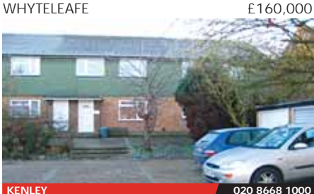
Large one bedroom ground floor maisonette, 22' lounge, double bedroom, refitted kitchen and batt room. Own private rear garden with direct access from the kitchen. Parking and garage. No onward chain.