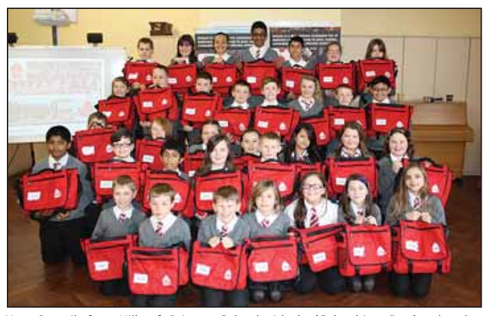
Year 6 pupils from Hillcroft Primary School with the 'School in a Bag' rucksacks.

improvement in the quality of teaching and the good behaviour of pupils, commenting that the children of Hillcroft are 'proud of their school'. In addition, the report highlighted that the school has an accurate view of its strengths and weaknesses and has the capacity to improve further. The pupils are hoping to share some of their school's success with disadvantaged children in the Philippines who are being provided with over 150 rucksacks of stationery, learning resources and eating utensils, paid for by the Hillcroft pupils. Over half a term their various fundraising efforts raised a total of £2,430 for the 'School in a Bag' project to help children less fortunate than themselves in conjunction with www.p-c-f.org