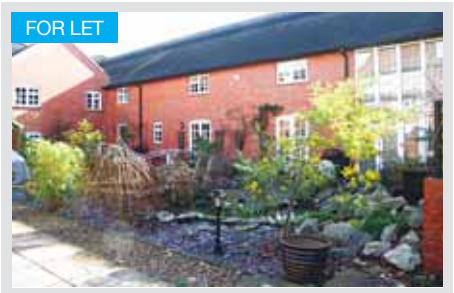
South Nutfield £2,695 pcm

A newly built beautifully presented 5 bedroom family home in this popular area situated within walking distance of Warlingham village shops and station. EPC:D