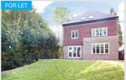
Warlingham £2,750 pcm

\begin{tabular}{ll} \textbf{Caterham £3,000 pcm} \\ A beautiful 5 bedroom detached residence located on the highly \\ \end{tabular} regarded Harestone Hill in Caterham, situated near to Caterham school and town centre. EPC:D