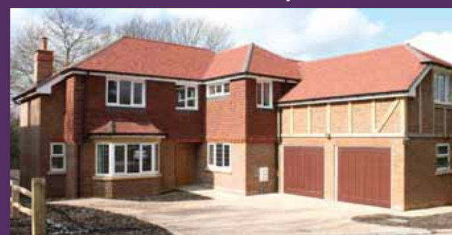
Meadow View, Caterham - £925,000