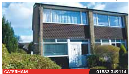
Featuring two double bedrooms and a 16' lounge/diner, this modern, end of terrace house is situated in a residential road close to local shops and transport links. The property benefits from double glazing and gas healing as well as front and rear gardens and a garage.