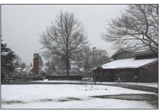
The scene in Queen's Park on Sunday, 24th March.

Updates will be posted on the Fun Run website at www. rotarvruns.co.uk