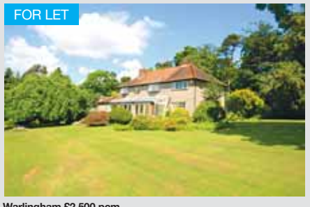
Warlingham £2,500 pcm

A beautifully appointed, light and spacious converted farm building of about 3,357 sq ft dating back to the 1890's and recently re-decorated throughout giving a fresh and modern feel to the property. \mbox{\ensuremath{\sf EPC:D}}