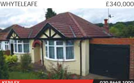
Deceptively spacious three double bedroom extended detached bungalow with garage and OSP, popular residential road in proximity to two Stations, local schools. Large rear garden, double glazing and new boiler. No onward chain.