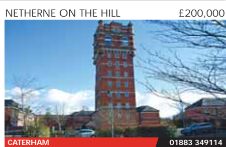
Situaled in a landmark property with outstanding views over the surrounding area and beyond, this one bedroom, split level apartment is offered for sale with no onward chain. Forming part of the original Helherne Hospital site, this water tower conver-sion features a 20' lounge, fitted kitchen, 176 bedroom with en-suite and undercover parking as well as a lift.