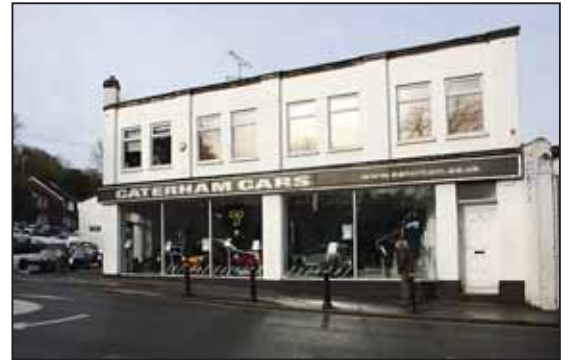
The Caterham Cars showroom in Station Avenue, Caterham.