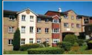
Caterham Valley - £895pcm

Stylish 2 double bedroom first floor flat in a sought after position. Large lounge. Stylish fully fitted kitchen. Bathroom. One allocated parking space and visitor permits are provided. Avail u/f.