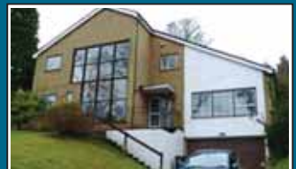
Kenley - £2500pcm

Spacious 3/4 bedroom detached house. Good sized hallway and cloakroom. Spacious lounge and dining room. Fitted kitchen. Family bathroom. Garden. Garage. Parking for two cars. Avail u/f.