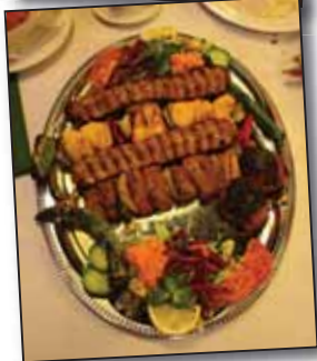
Our sumptuous main course.

food is that it is beautifully flavoursome without being too spicy, but why not pop down to Croydon Road and try this exciting new restaurant yourself?