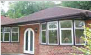
Caterham Valley - £1100pcm

Large 2/3 bedroom top floor apartment close to the town centre. Lounge. Bathroom. Fitted kitchen. One allocated parking space. Avail part furnished end of Feb.