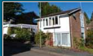
Caterham - £1700pcm

Well appointed first floor 2 double bedrooms apartment within walking distance of Reigate town centre. Both bedrooms come with fitted wardrobes. Master bedroom with ensuite shower room. Family bathroom. Large lounge. Fully fitted kitchen. Parking for 2 cars. Avail u/f.