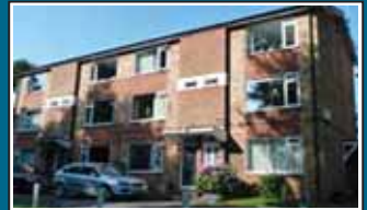
Caterham - £895pcm

Very nicely presented two bed first floor flat. Fitted kitchen. Spacious lounge/diner. Master bedroom with fitted wardrobes. Allocated parking. Avail u/f.