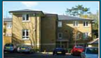
Caterham - £1100pcm

Charming 1 bedroom end of terrace Victorian Cottage. Lounge. Fitted kitchen and back door leading onto a surprisingly long garden. Bedroom with fitted wardrobe and bathroom with bath and shower attachment. Parking for 1 or 2 cars. Avail u/f.