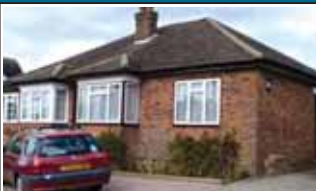
Warlingham - £1250pcm

Spacious 2 bedroom house. Two reception rooms with dividing doors. Fitted kitchen. Downstairs WC. Family bathroom. Garden. Driveway parking. Avail u/f April.