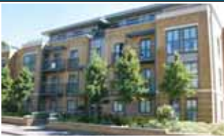
Caterham Valley - £1100pcm

Stylish two bedroom ground floor apartment. Spacious lounge with open plan stylish fully fitted kitchen and a private balcony. Master bedroom with ensuite shower room. Family bathroom. Allocated parking. Avail u/f.