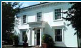
Reigate - £1495pcm

Two large double bedrooms bungalow has been completely refurbished. Good sized lounge. Brand new kitchen with integrated appliances. Brand new bathroom. Off street parking and garage. Garden to rear. Avail u/f.