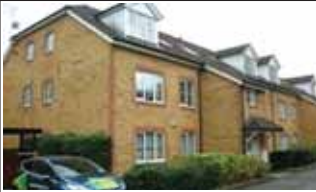
Whyteleafe - £795pcm

Spacious one bedroom ground floor apartment with good sized lounge. Fitted kitchen. Bathroom with bath and shower attachment. Spacious and light bedroom. Allocated parking & visitor bays. Avail u/f.