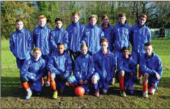
The Under 15s in their smart coats sponsored by Bib & Tucker Dry Cleaners.