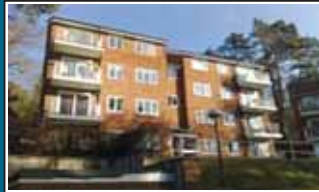
Whyteleafe - £895pcm

Spacious one bedroom ground floor apartment with good sized lounge. Fitted kitchen. Bathroom with bath and shower attachment. Spacious and light bedroom. Allocated parking & visitor bays. Avail u/f.