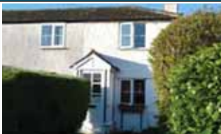
Godstone - £895pcm

Two double bedroom ground floor maisonette. Large double aspect lounge and separate kitchen. Bathroom. Garage and parking. Use of communal gardens. Avail u/f.