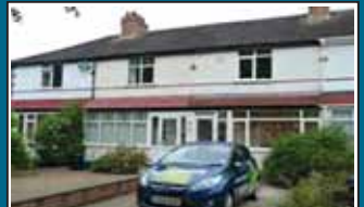
Warlingham - £1100pcm

Spacious 2 bedroom house. Two reception rooms with dividing doors. Fitted kitchen. Downstairs WC. Family bathroom. Garden. Driveway parking. Avail u/f April.