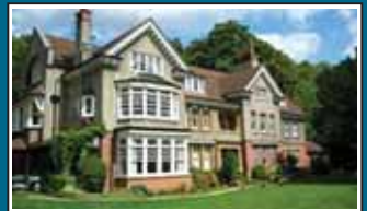
Caterham Valley - £1100pcm

Spacious 2 double bedroom apartment. Spacious lounge. Stylish fully fitted kitchen. Master bedroom with ensuite shower-room. Family bathroom. Secure gated underground allocated parking. Avail u/f.