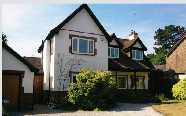
Bluehouse Lane, Oxted £2,250 pcm A detached, 3 bedroom, 2 bathroom, double fronted family home. EPC: D