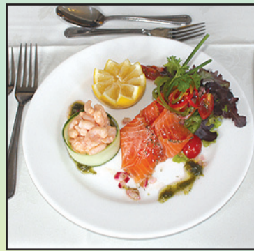
Home-cured salmon with prawns.