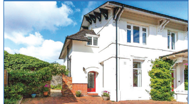
An opportunity to acquire a unique wing of an elegant Victorian detached property situated in a highly sought after residential road enjoying stunning views to the front and offered in excellent decorative order. EPC E.