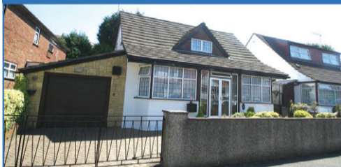
A three bedroom detached chalet style bungalow offered in good decorative order throughout with the benefit of low maintenance front and rear gardens and attached garage situated in a popular residential road and offered to the market with no onward chain. EPC E.