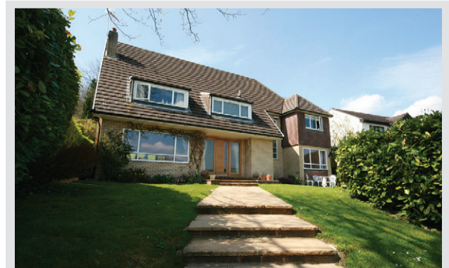
Greenhill Down, Woldingham £2,250 pcm A beautifully presented 5 bedroom detached family house offering spacious accommodation of about 2130 sq ft. EPC: C