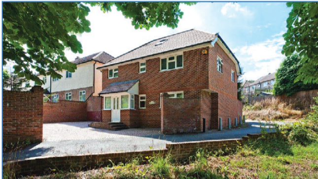
A five bedroom detached property planned over three floors and in our opinion offering good sized accommodation in excellent decorative order and occupying a popular residential location on the edge of Coulsdon Common. EPC C.