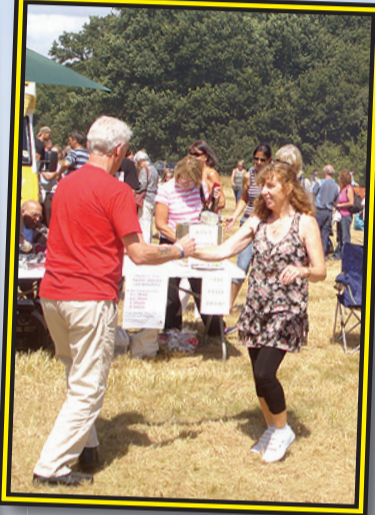
Dancers try out some moves at the 'Simply Le Roc' stand.