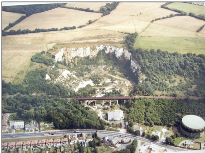
Riddlesdown Quarry.

wildlife. Although the quarry is closed to the public and surrounded with a high security fence, organised groups are given pre-arranged guided walks during the summer months by rangers to view flowers, birds, insects and butterflies. The success of this story is how an old industrial site has been colonised by wildlife, and has become an oasis of conservation amongst the hustle and bustle of the 21st century.