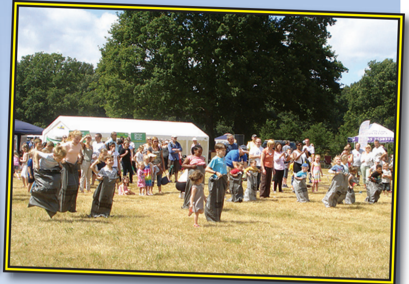
Good old-fashioned fun with the children's sack race.