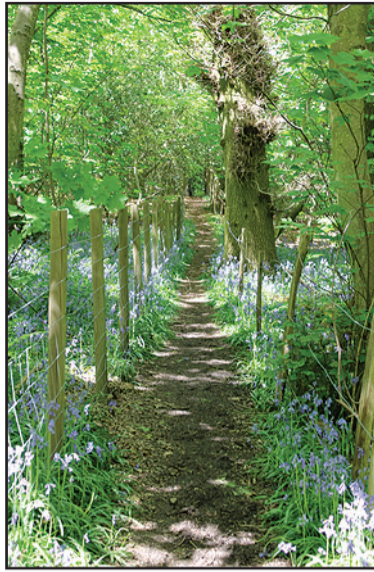
The winning photo of the woodland walk by 14 year-old Amy Jones.

The Open Day will give local residents the opportunity to meet members of the CR3 Forum who have been working in the different groups within the Neighbourhood Plan. Presentations in the morning and afternoon will explain the progress of the Plan so far in preparation for the formal consultation period to be held next spring. The CR3 Forum will be