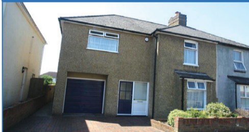
A substantial three/four bedroom semi detached family home with block paved driveway, integral garage and well established level rear garden situated in a popular residential road and offered to the market with no onward chain. EPC D.