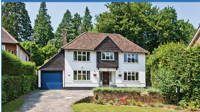
An attractive four bedroom detached family home occupying a well established plot with driveway providing ample off street parking situated in the sought after Harestone Valley area of Caterham. Viewing highly recommended. EPC E.