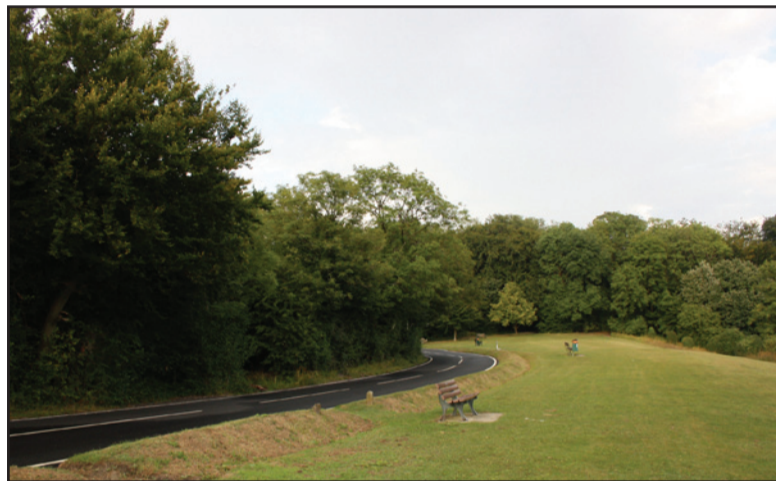
Old Park Wood at View Point in Caterham.