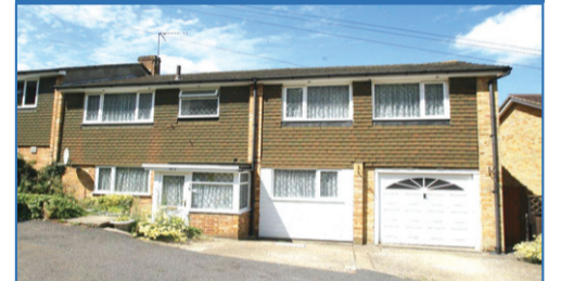
A larger than average four bedroom semi detached family home incorporating first floor annex accommodation consisting of additional lounge, former kitchen area and bedroom with en suite bathroom. Internal viewing recommended to appreciate this unique and adaptable home. EPC D.