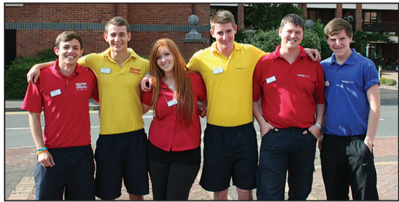
The Tandridge Leisure Centre team.