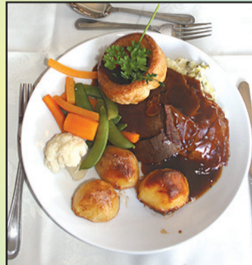
Roast beef and all the trimmings.

custard and I had the chocolate cake with cream. Our dreamy desserts were the perfect way to end the meal. By the way, I checked out their new 'Wine Down Wednesdays' recently, which I also highly recommend! (See advert above for details.)