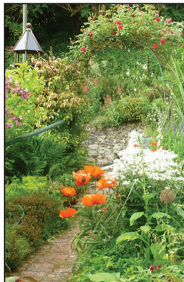
Jill and Walter's garden.