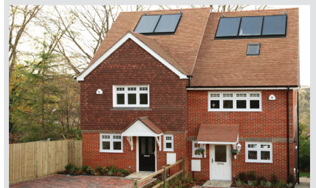
Caterham Guide Price £440,000 A brand new semi detached family home built by Village Developments offering spacious accommodation, located in a prestigious gated development. EPC: B