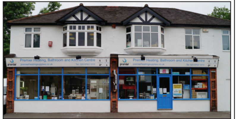
Premier Heating in Godstone Road, Whyteleafe.

So come and check out our new look and ranges and join us by having a bright new makeover for your bathroom!