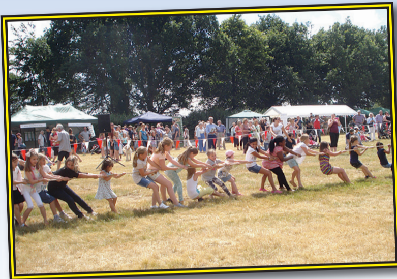
Heave-ho! The girls' end of the Tug o' War.