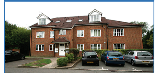
A two bedroom purpose built ground floor flat which is in our opinion offered in excellent decorative order situated close to local shops and two railway stations. EPC TBC.