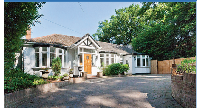
An attractive four bedroom detached chalet style bungalow offering deceptively spacious and contemporary style accommodation and with well established south facing level rear garden. Internal viewing highly recommended. EPC D.