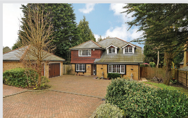
Brighton Road, Banstead £3,500 pcm An outstanding detached family home located on a quiet cul de sac close to Banstead Village. EPC: D