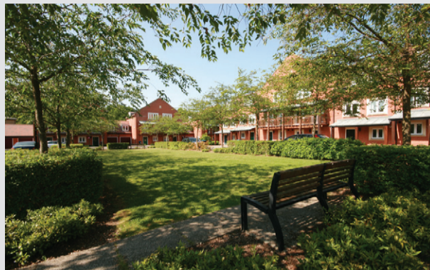
Caterham £369,950 A well-presented and spacious end of terrace 4 bedroom house of 1657 sq ft with a private parking space, garage and in a popular square on the sought after Village Development. EPC: C