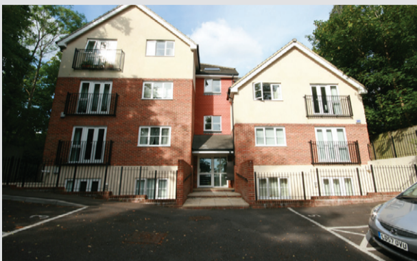
Warlingham Guide Price £267,500 Beautifully presented 2 bedroom first floor apartment built in 2008 by Martin Grant Homes, situated in a convenient location within half a mile of Upper Warlingham Station. EPC: B