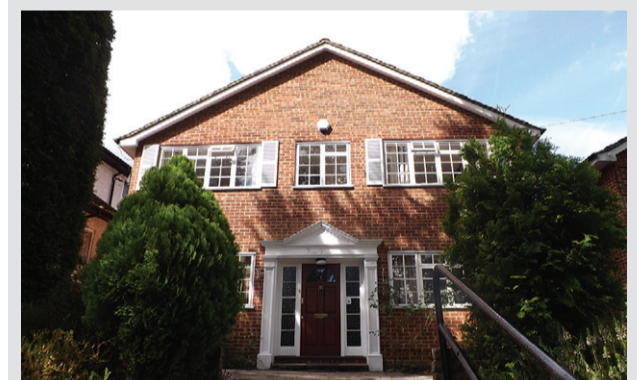
Riddlesdown Road, Purley £1,750 pcm Well proportioned family home close to the centre of Purley. Includes parking. EPC: F