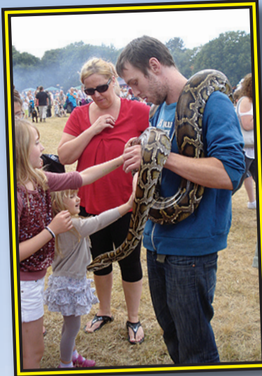
The Burmese Python attracted plenty of attention.

Scouts' delicious barbecue. Kenley and District Residents Association and City of London Commons sponsored the event and the organisers would also like to thank All Saints Church, the Air Training Cadets, International Needs UK and Scouts Active Support for their help in running the activities.