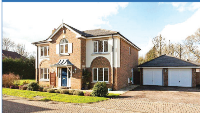
A five bedroom detached house with double garage and landscaped level rear garden occupying an enviable position within this exclusive cul de sac and offered in our opinion in excellent decorative order throughout. EPC D.