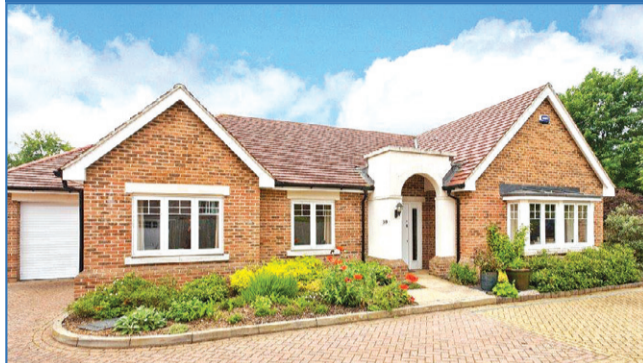
A stunning and rarely available modern detached bungalow occupying a prime level position within a highly sought after residential development and offered to the market with no onward chain. EPC C.