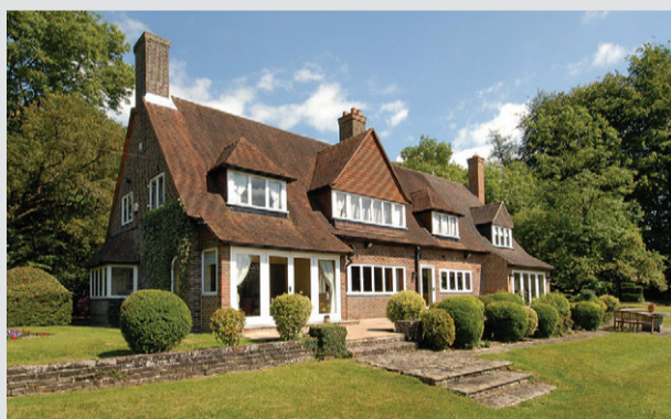
Pilgrims Way, Chaldon £3,750 pcm A beautifully refurbished 5 bedroom period house in a stunning plot of several acres. EPC: D