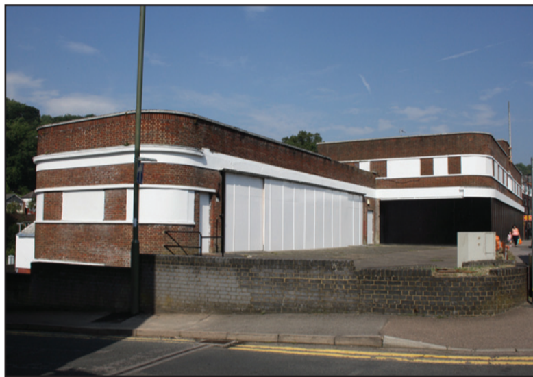
The Rose & Young building in Croydon Road.

The Section 215 Notice served by the Council to tidy up the building remains in effect which means it is possible for the Council to return to court in the future, should the appearance of the building deteriorate.