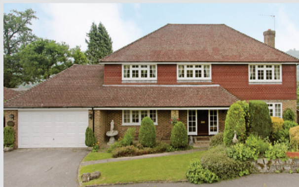
Caterham Guide Price £695,000 In a peaceful location with views across Harestone valley this spacious 5 bedroom family house of 2928 Sq Ft is set in a quiet location on a private residential cul de sac. No onward chain. EPC: D