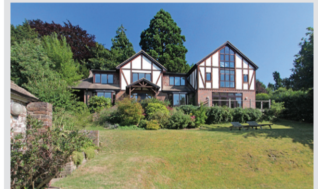
Caterham Guide Price £1,295,000 Close to Caterham School is this contemporary and beautifully presented 5/6 bedroom house, modernised to a high standard and benefiting from lovely views. EPC: D