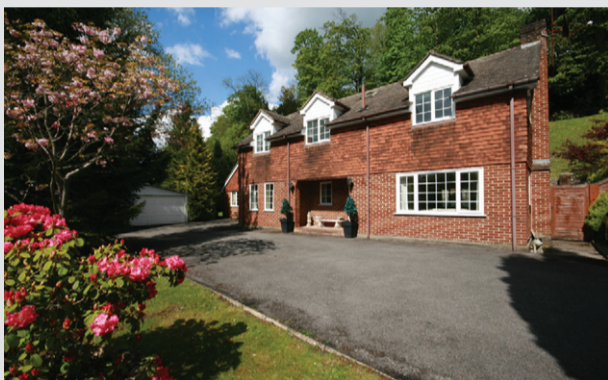
Warlingham £600,000 With views towards Manor Park is this spacious and well presented 4 bedroom detached property with extensive ground floor living space and conveniently located for the commuter. EPC: E