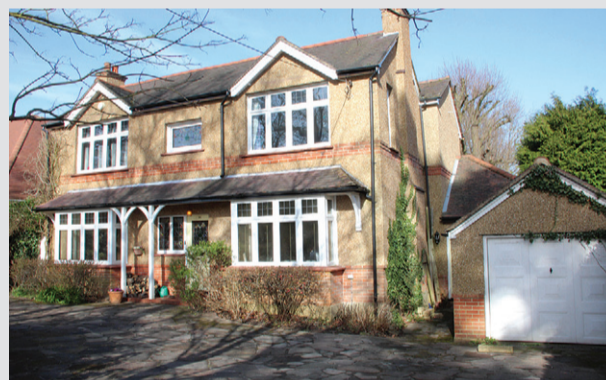
The Heath, Caterham £2,500 pcm A delightful family home situated on a quiet private road, with a beautiful mature garden. EPC: E