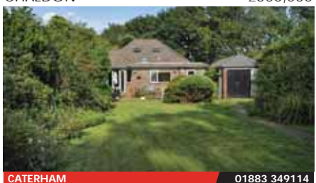
Situated in a semi rural location backing onto and with views of farmland, this detached chalet bungalow offers adaptable accommodation as wel as a large garden and parking. The property is currently arranged as two bedrooms with two separate reception rooms to the ground floor as well as a kitchen breakfast room and modern, refitted bathroom. To the first floor is a useful, double aspect, loft room with en-suite bathroom.