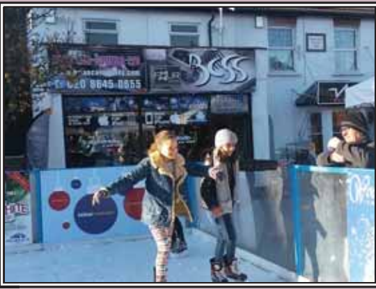
Youngsters having fun on the open air ice rink.

Anyone interested in sponsoring next year's Coulsdon Yulefest can contact the organisers by e-mailing info@yulefest.co.uk