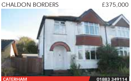
Shaated in a tuded away oul-de-ser, this three bedroom, semi detached family home offers a haddlornal layout with scope to extend and improve. The ground floor benefits from a 24 lawage direr that opens into a double glazed consensity that in hum opens to the garden. These is also a filled littlers with separate ear access. The first floor comprises hum double bedrooms and a single as well as a family bathroom.