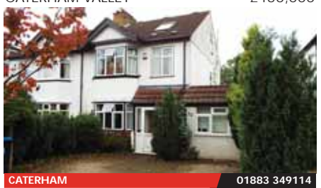
Stated in a public location down 19. Anth's Short offers describely gardons assumedation accomplane there from Thee is an elebed lithhed filter and upon pion family are and down leading In the gastes. This commonly is the hard of the town. In the yound from thee is a subfloor in perform must all filter norm consent you meet for one as a belown on such as shown count or withly morn. The first for assummation complete how dude bedroom, a single count and a efficied family bedroom in the log flow is a suffer double bedroom and down cross.