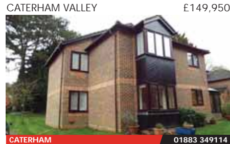
This two bedroom, First Floor property features a double bedroom with built in wardnotes, a second bedroom, fitted litchen and badhroom as well as a lounge with bay window. The flod overlooks the communal gardens to both the floor and new and there is ample parking for residents and guests. Within the development are various facilities including a learndy, residents' conservatory and visiting house manager.