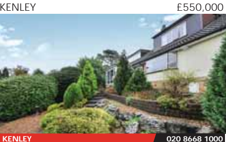
Five bedroom, two reception, three bathroom detached chalet bungalow with views over the close proximity to Kenley Station. Double garage and OSP.