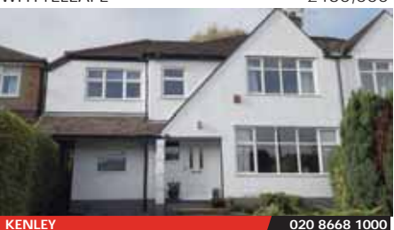
Spacious four bedroom extended semi detached house, located within a sought after resident with views. Two receptions, two bathrooms, OSP. Close proximity to two stations.