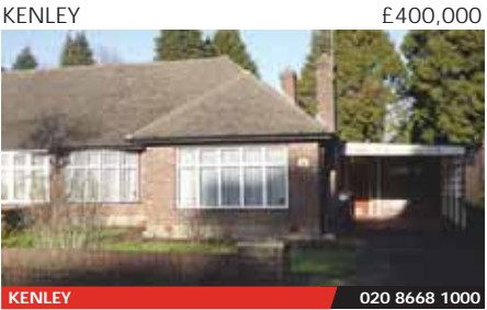
Three bedroom semi detached bungalow located within a sought after location. Level plot, garage and OSP. No onward chain.