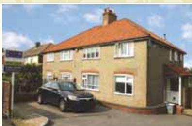
Caterham on the Hill £239,950

A substantial Victorian family home approached by a private gated driveway flanked by mature trees and set in an elevated and private position, within easy access of Caterham School and Caterham mainline station. EPC Rating D. UPC1647