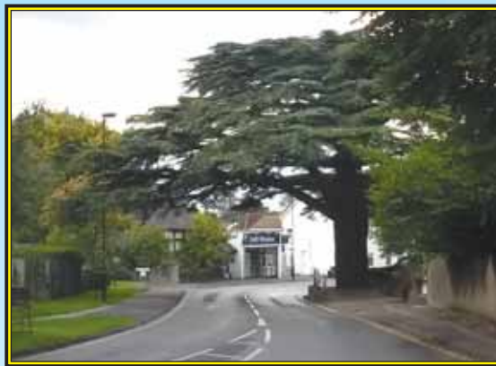
The ancient cedar tree that forms the gateway to Caterham-on-the-Hill