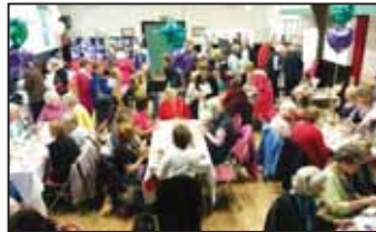
The packed Chaldon Village Hall.