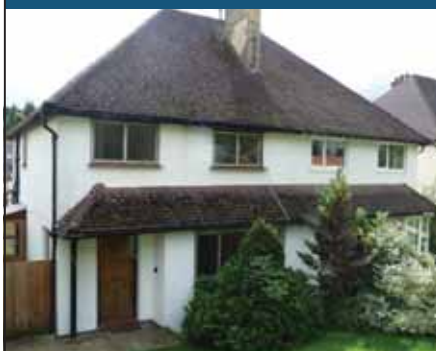
Caterham - £340,000

A good size three bedroom semi-detached property. The house has good size bedrooms, open plan kitchen and two good size reception rooms along with a conservatory and downstairs cloakroom. There is a good size garden front and back as well as plenty of scope to improve or extend. An internal inspection is highly recommended.