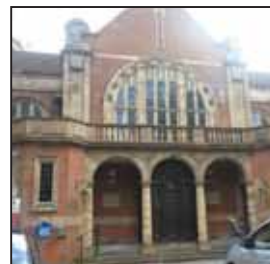
The Soper Hall in Caterham Valley.