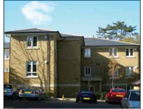
Caterham Valley - £1200pcm

Two bedroom, two bathroom apartment in sought after gated development. Walking distance of train station and town centre. Large open plan kitchen/living room with integrated appliances. En suite bathroom to master bedroom. Allocated parking.