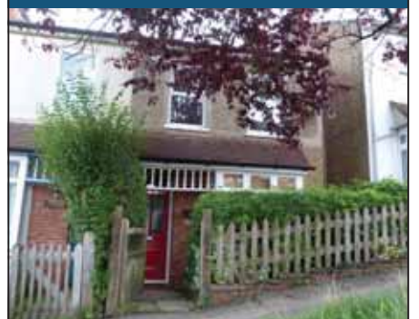
Caterham - £300,000

A two bedroom semi-detached home with kitchen, two reception rooms, upstairs bathroom and attractive rear garden, situated on a quiet road with plenty of parking. Located within close proximity to the town centre, train station and shops.