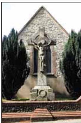
The St. Lawrence's War memorial.

96 years on, an application has been submitted to the