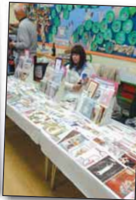
The colourful card stall.