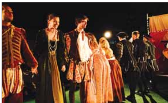
The cast take a bow at the end of the performance.