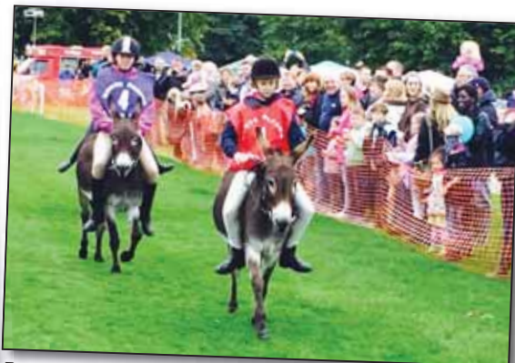
Exciting Donkey Derby action at the Godstone Village Fete.