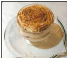
Our creamy Tiramisu.

Tuesdays are an especially good time to visit, when Casa Lola offers half price skewers (see advert above).