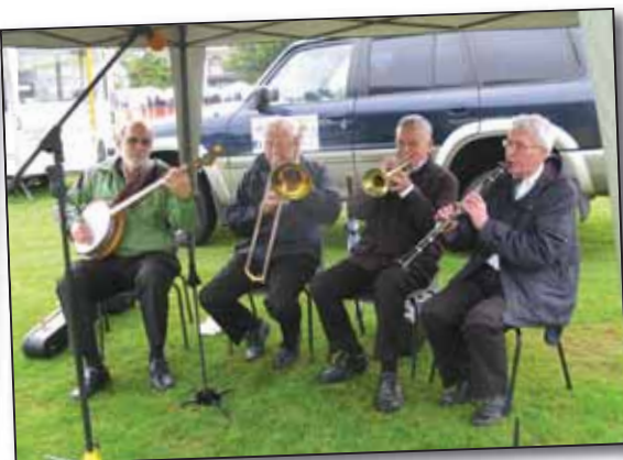
The Dixie Hotshots jazz band.