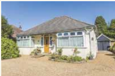
Caterham on the Hill £550,000

An opportunity to acquire a two bedroom freehold lodge house with private front and rear gardens and gravelled driveway situated in a rarely available and convenient cul-de-sac location. Viewing highly recommended. EPC Rating E. UPC1665