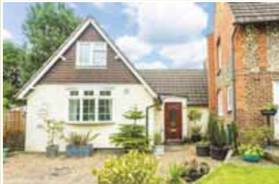
Caterham Valley £385,000

An opportunity to acquire a two bedroom freehold lodge house with private front and rear gardens and gravelled driveway situated in a rarely available and convenient cul-de-sac location. Viewing highly recommended. EPC Rating E. UPC1665