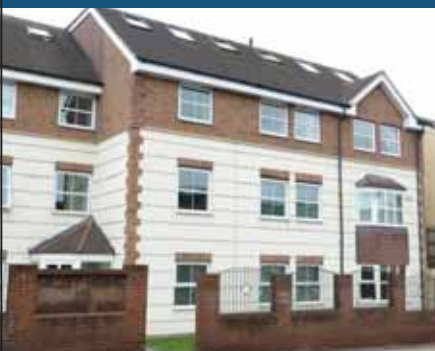
Whyteleafe - £274,950

A two bedroom modern, ground floor apartment with own private garden and allocated parking space. Spacious lounge/dining room with open plan kitchen. En-suite shower room to master bedroom. Close to two train stations and within walking distance of local amenities.