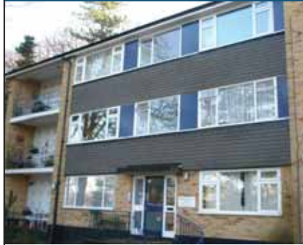
Caterham Valley - £1100pcm

A two bedroom top floor flat in a quiet location close to town centre, shops and train station. Newly redecorated and newly carpeted. Good sized rooms. Bathroom and separate toilet. Communal garden, off street parking and garage. Available now.