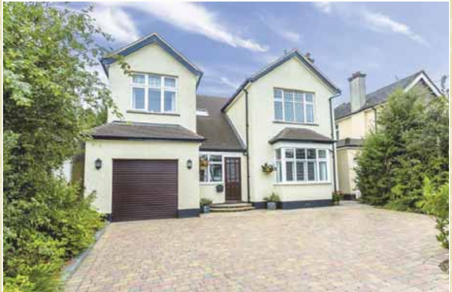
Caterham on the Hill

A delightful detached double fronted three/four bedroom chalet bungalow offering versatile accommodation set in stunning cottage style gardens and situated in a popular residential road in Caterham on the Hill. EPC Rating E. UPC1659