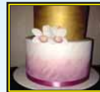
Two-tier orchid cake.

For more information and opening times visit www.thewildblackberry.co.uk