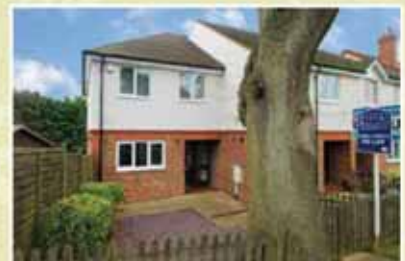
Caterham on the Hill

A three bedroom detached bungalow in easy walking distance of both Upper Warlingham and Whyteleafe train stations. The property has undergone complete redecoration and had new carpets fitted throughout. Garage is included. EPC Rating E.