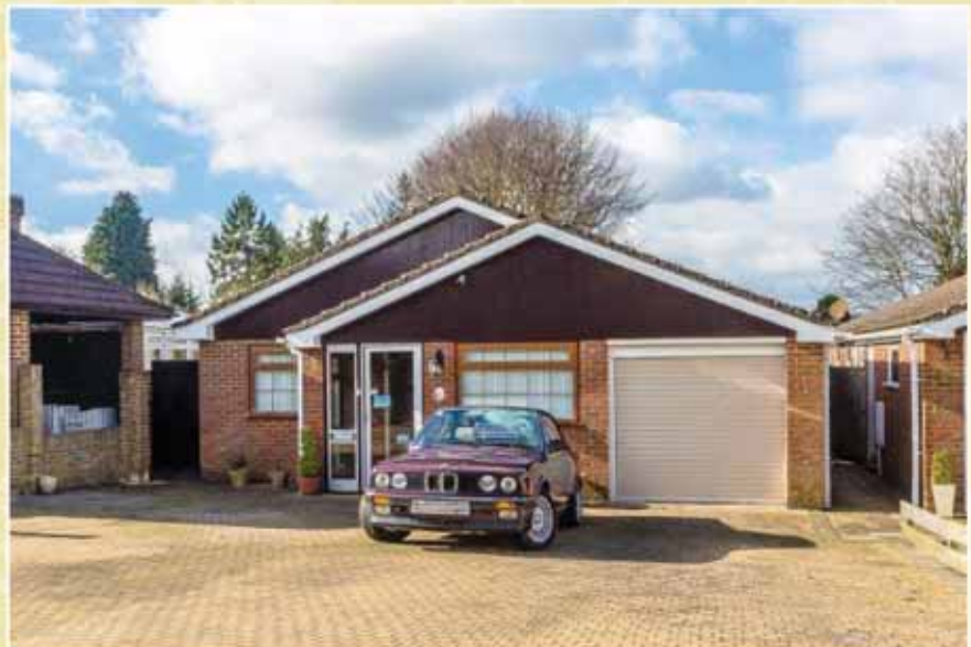
Caterham Hill OIEO £600,000

An opportunity to acquire a one bedroom ground floor luxury apartment with allocated off street parking situated in a prestigious private road with views towards Queens Park to front and offered to the market with no onward chain. EPC Rating C. UPC1732