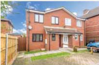
Caterham Hill £395,000

An opportunity to acquire a larger than average three bedroom semi detached house with black paved driveway and level rear garden situated in a popular residential road and offered to the market with no onward chain. EPC Rating D. UPC1724