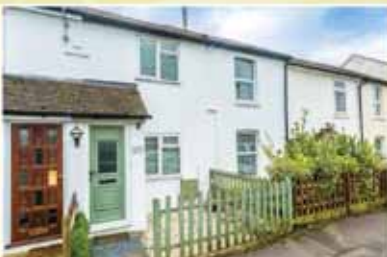
Caterham Hill Guide Price £300,000

A well presented four bedroom detached family home with driveway and attached double garage occupying a prime position within a highly sought after and rarely available private cul-de-sac in the popular village of Kenley. EPC Rating TBC. UPC1735