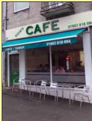
Eddie's Cafe in Chaldon Road.