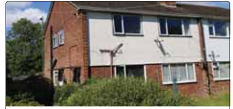
GODSTONE £950 PCM Two Bedroom maisonette located in Godstone village, available January Caterham Office • 01883 622244