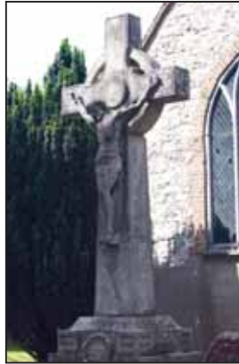
St. Lawrence's War Memorial.

Contributions to the cleaning project can still be made to: Memorial Fund Treasurer, 32