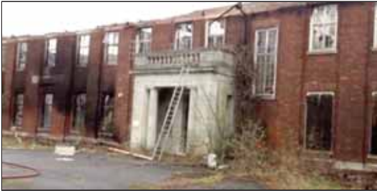
The charred facade of the Officers' Mess after the fire.