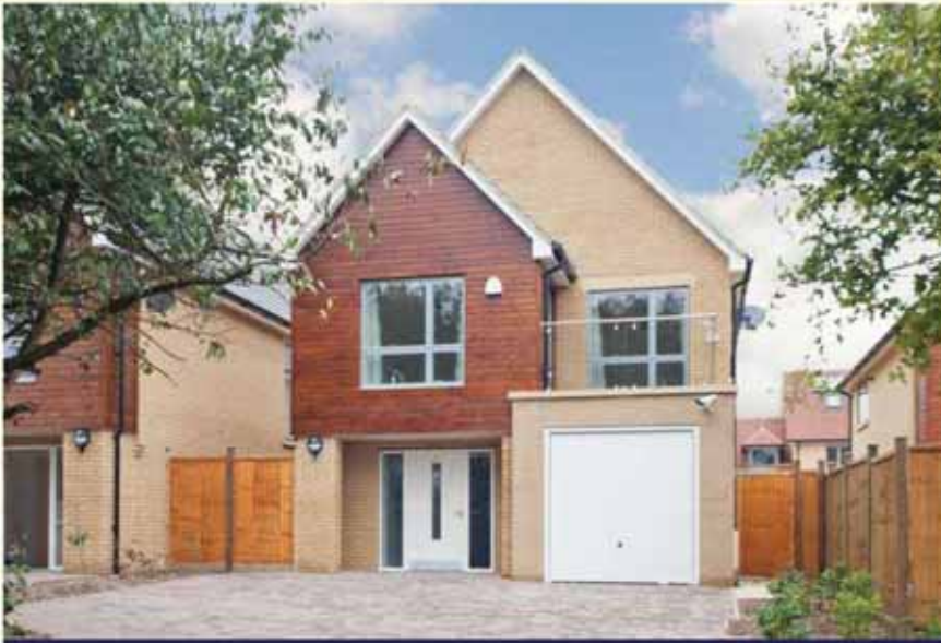
Caterham on the Hill