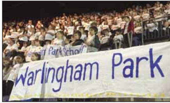
Warlingham Park students at the O2.

The school's choir prepares for this event through much of the autumn term, learning a variety of vocal repertoire written in several parts and sometimes in different languages. By the time they arrive at the O2, the children know everything by heart and are able to enjoy the singing experience with