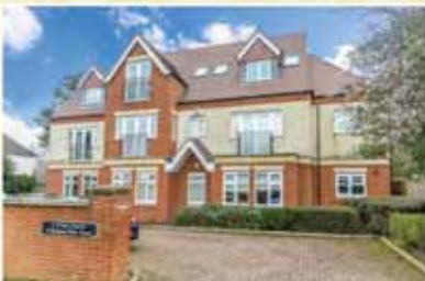
Caterham Hill Guide Price £239,950

A well presented two bedroom Victorian house with south west facing level rear garden situated in a highly sought after residential road. Viewing highly recommended. EPC Rating D. UPC1734