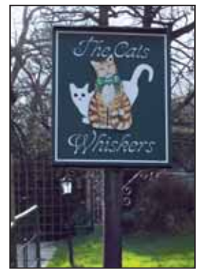
The Cats Whiskers cattery at The Mardens.