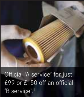
Official ‘A service’ for just £99 or £150 off an official ‘B service’. †

At Mercedes-Benz Caterham – Used Cars, maintaining your car’s performance, safety and comfort is our priority. Ensure your car has a Mercedes-Benz Recommended Service and receive the added benefit of FREE Roadside Assistance cover for 12 months including replacement car cover and more.* So please ask yourself, why would you go anywhere else?