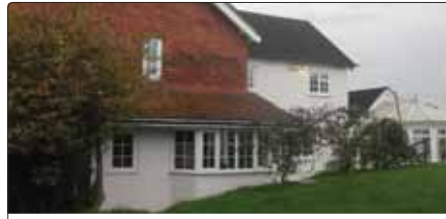
SOUTH GODSTONE £1,600 PCM Three Bedroom country cottage in South Godstone, available February Caterham Office • 01883 622244