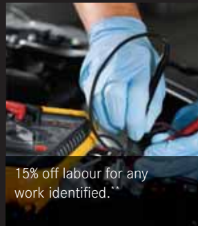
15% off labour for any work identified. **