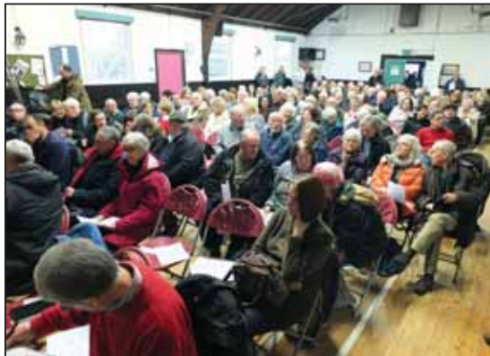
Chaldon residents at the meeting in Chaldon Village Hall.

On Friday 12th February, residents packed Hillcroft School hall in Caterham-on-the-Hill to hear representatives of the CR3 Forum explain how the CR3 Neighbourhood Plan will help to influence future planning decisions made by Tandridge District Council (see article on page 3).