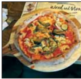
The 12" Vegetarian Pizza.

The restaurant also does a takeaway and home delivery service. See their advertisement for more information.