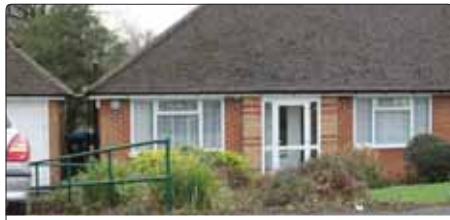
SOUTH GODSTONE £1,195 PCM Two Bedroom semi-detached bungalow located in a quiet cul de sac, gardens, available end of January Caterham Office • 01883 622244