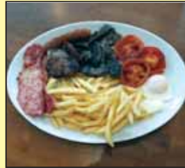
The Mixed Grill.