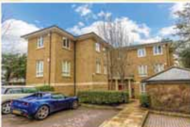
Caterham Valley £325,000

An opportunity to acquire a larger than average three bedroom semi detached house with black paved driveway and level rear garden situated in a popular residential road and offered to the market with no onward chain. EPC Rating D. UPC1724