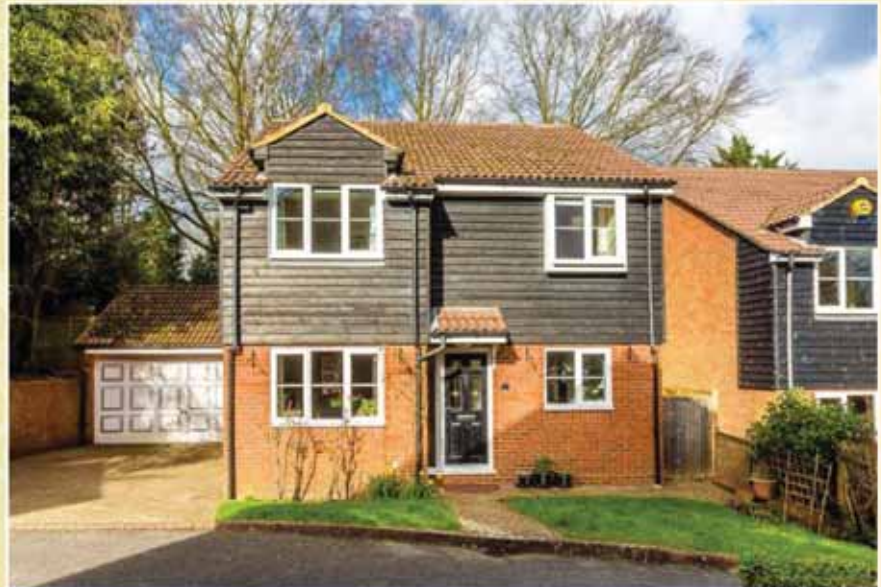
Kenley Guide Price £600,000

A two bedroom purpose built luxury apartment situated in a highly sought after gated development with off street parking conveniently located for Caterham Valley town centre with main line train service into central London and offered to the market with no onward chain. EPC Rating B. UPC1731