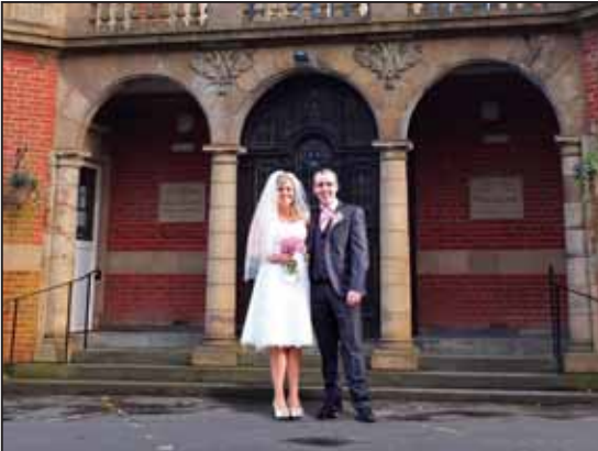
A bride and groom outside the grand entrance to the Soper Hall.

been one of our aims ever since we took over the management of the hall and we are so happy that we will now have local couples getting married in our beautiful heritage building. "The Hall is well linked to rail and road networks and can seat up to 120 people in glorious wood panelled surroundings. Indeed, this means that you can get married and have your reception all at the same location!" For more information about the Soper Hall visit www.soperhall.org .