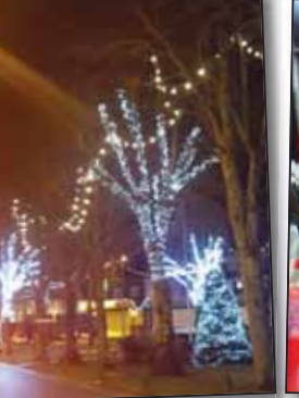
Some of the illuminated Warlingham lights.