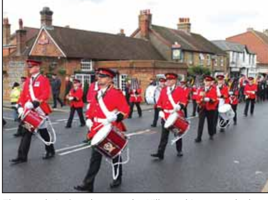
The parade in Caterham-on-the-Hill marching towards the memorial outside St. Lawrence's ancient church.