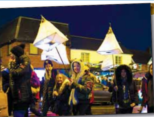
Children in the lantern parade march to Warlingham Green.