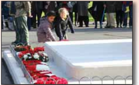
Brownies lay a wreath at the Tribute at Kenley Airfield.