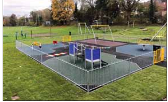
The new play area in Stafford Road

man of the Community Ser-vices Committee, said: "We are delighted to announce the opening of the new children's play area in Stafford Road Open Space which will provide local children with an exciting and secure place to play for many years to come. We look forward to seeing local residents enjoying the new and improved facilities."