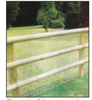
The style of the proposed new perimeter fence. across the airfield."

A public consultation on the proposals will be held when the planning applications are submitted next year.