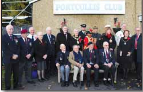
Veterans and Dignatories at the Royal Air Force Association ("RAFA") Portcullis Club after the wreathlaying at the Tribute at Kenley Airfield.