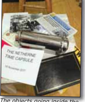
The objects going inside the time capsule included a set of coins from the present day and a copy of The Pictorial History of Netherne.