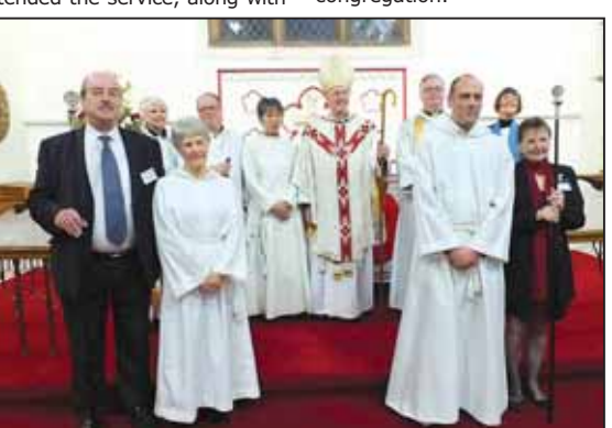
The Rt Revd Christopher Chessun, Bishop of Southwark, with local clergy and members of St. Luke's Church after the 150th anniversary service.

Following the service, nearby Whyteleafe School kindly hosted refreshments for members of the clergy and congregation.