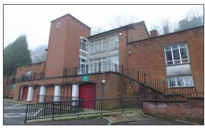
Caterham Valley Library.

For more information about opening times and services available at Caterham Valley Library, visit www.surreycc.gov.uk/people-and-community/libr