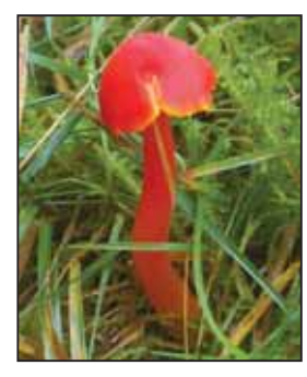
Scarlet Waxcap by Adele Brand.

Waxcaps are more than just a colourful addition to our countryside. They are very sensitive to disturbance and artificial fertiliser, and can take decades to recolonise a damaged site. Waxcap-rich grasslands are in steep decline across Europe, and the UK now has an international responsibility to conserve them. Unfortunately, unimproved grassland is one of our most threatened habitats - it is rapidly disap-