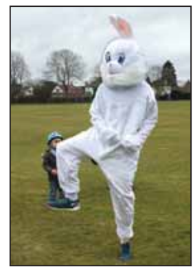
The Easter Bunny warming up at last year's Rotary Bunny Fun Run.

A registration form and fee is required for each runner. The registration fee (non refundable) is £6 for the 5k Race and £3 for the 1k Run. Registration taken out on the day is double the pre-registration cost. Registration reserves a place at the start of the race and the finisher's