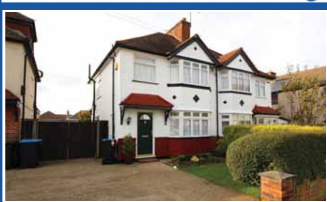
CATERHAM ON THE HILL OIRO £400,000 FREEHOLD

I located in a great position for Caternam fown centre and railway st REAR SOUTH FACING BALCONY, NO ONWARD CHAIN! EPC: C Call 01883 349035 to arrange a viewing