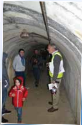
A visit to a bomb shelter.