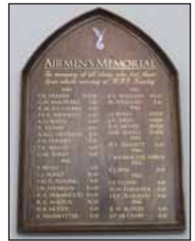
The memorials bearing the names of the airmen who died whilst serving at Kenley Airfield.