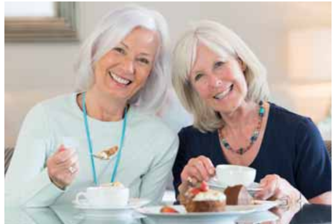
Home is at the heart of your retirement