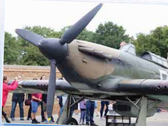
A replica Hurricane in one of the blast pens.