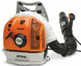
The Stihl BR600 leaf-blower.