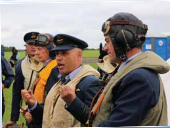
The pilots at Kenley Airfield.