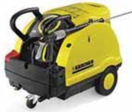
The Karcher HDS 601 Pressure Steam Cleaner.

The Centre was also raided in November 2016, just days after it held a successful Christmas Fair to raise funds.