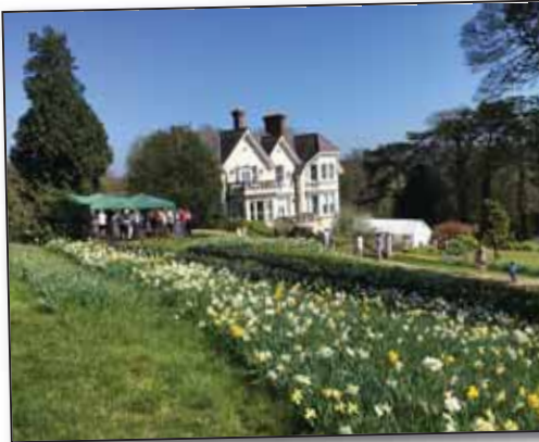
Open Garden at The Chalet.