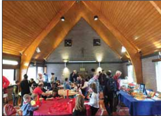
Model enthusiasts of all ages pack the Centenary Hall.

The 5th Caterham Scouts were back again on Saturday 16th September with their impressive Model Show in the Centenary Hall, EsSENDENE ROAD, Caterham-on-the-Hill. The show featured 20 displays, double the number from last year, including Meccano and Lego models. The organiser, Peter Corish, would like to thank everyone who supported the event, especially the local sponsors.