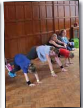
Youngsters taking part in the FunFit Kids class.