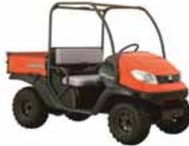
The Kubota RTV500G