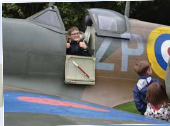
An excited youngster in a Mk II Spitfire.