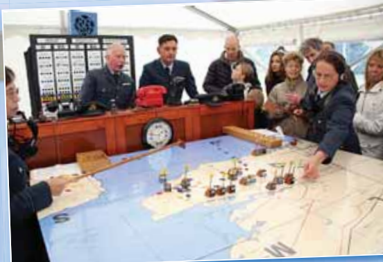
A re-enacted Ops Room.