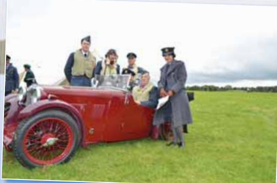
Members of "RAF at War" living history group in a 1932 MG.