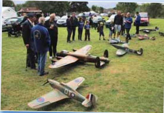
The Model Aircraft Display outside the Portcullis Club.