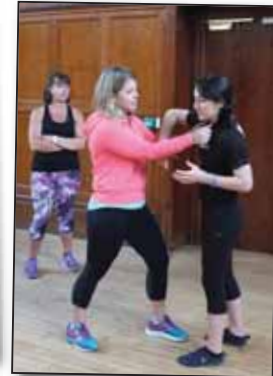
A Self Defence class by Oxted Karate School.