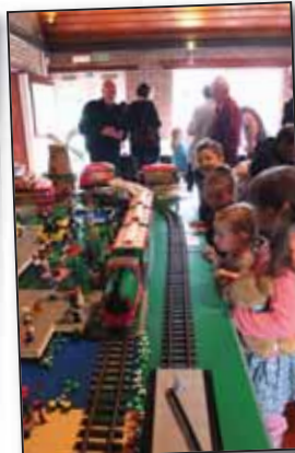
Youngsters gaze at the train going by on the model railway.