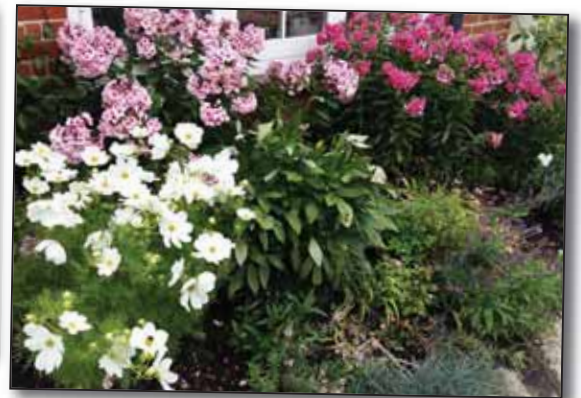
A stunning flower bed at Tollsworth Manor.