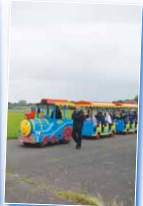
Visitors tour the Airfield.