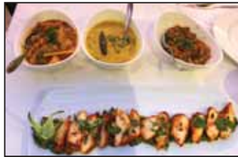
The Chicken Tikka Nahar and accompanying vegetable dishes.

a skewer on a bed of spinach in a thick creamy sauce). We shared a portion of mushroom rice and the lentils and squash. We had a bottle of the house wine, a crispy Chardonnay, with our meal. Ali said they are very proud of their carefully selected wine list.