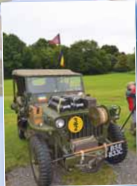
A Ford Jeep.