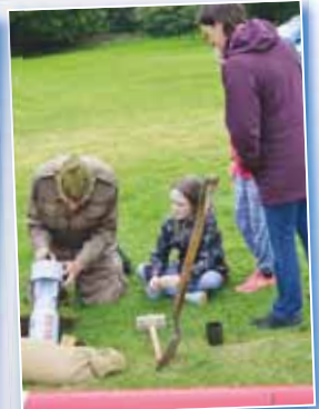
A lesson in disarming a bomb.