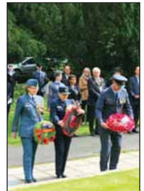
Representatives of the Australian, New Zealand and Canadian RAF lay a wreath in Airmen's Corner.