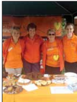
The Tandridge Friends of St. Catherine's Hospice at Tollsworth Manor.