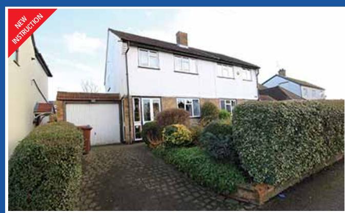
CATERHAM ON THE HILL £379,950 FREEHOLD

A THREE BEDROOM SEMI DETACHED house with a garage to the side, driveway and a secluded rear level garden. The house requires MODERNISATION and has GREAT POTENTIAL TO EXTEND to the ground floor and within the loft (subject to planning permission), so ideal to create a home to your design and style! Call 01883 348035 to arrange a viewing.