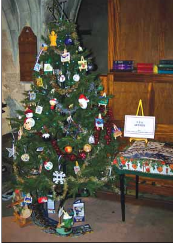
The splendid six-foot Caterham U3A tree adorned with handpainted Christmas and art-themed decorations that was voted joint first place with the Caterham Horticultural Society tree.