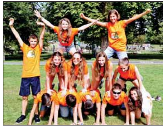
Italian students having fun in Queen's Park, Caterham

Afternoons are often spent at Queen's Park, where the committed and passionate young volunteer leaders seek to promote social and personal development through sport and team games.