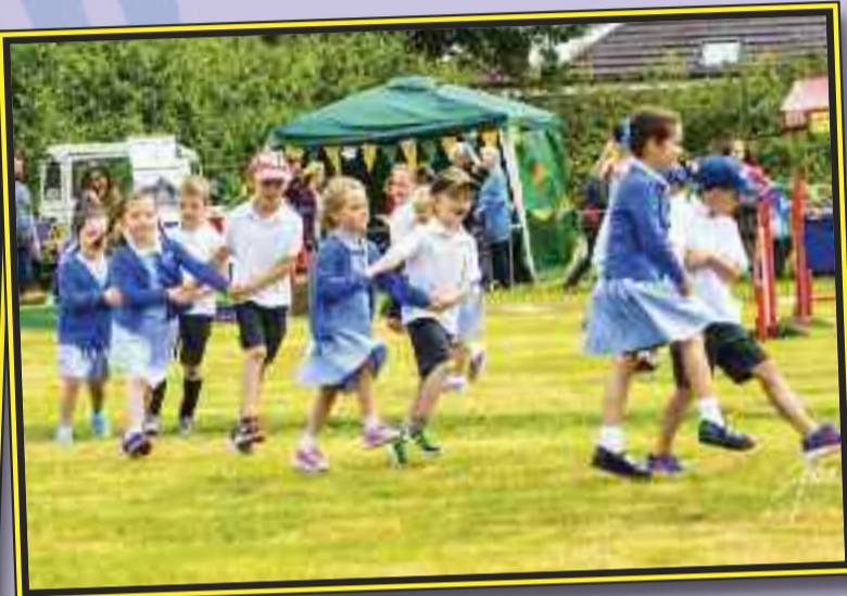
Warlingham Village School country dance display.