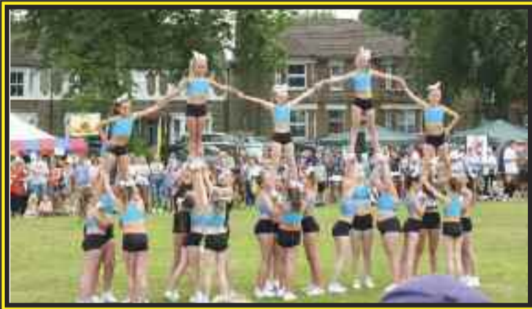
The spectacular arena display by Caterham Allstars.