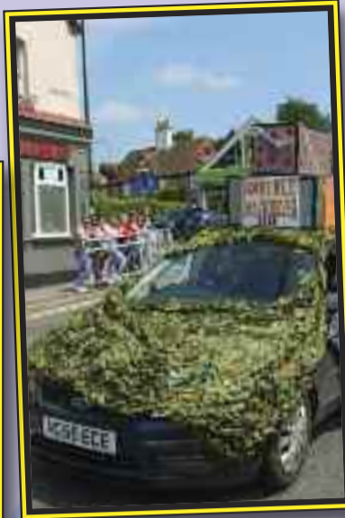
The winning "Orrible Histories" float in the procession.