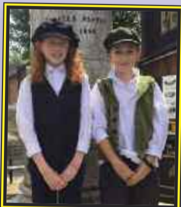
These youngsters by the Asprey Fountain took part in the Poetry Trail - a new Festival event to commemorate the end of WWI.