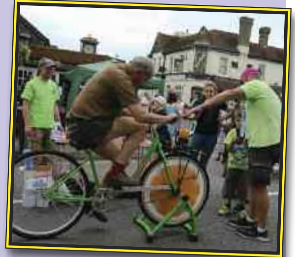
The Urban Smoothie Bike was hard work, but popular!