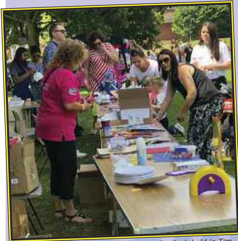
Children's craft activities at the Picnic in the Park held in Timber Hill Recreation ground on Sunday 24th June, sponsored by Caterham Valley Parish Council. £250 worth of craft materials was kindly donated by Craft Stationers in Godstone Road.