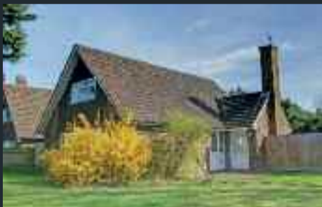
SOUTH CROYDON £2,195pcm

BARKER STONE ARE DELIGHTED TO OFFER A FULLY MANAGED SERVICE TO ALL LANDLORDS FOR JUST 7% +VAT ON COMPLETION OF SIGNED TERMS AND CONDITIONS BEFORE 31/08/2018