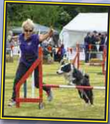
Valgray's dog agility display.