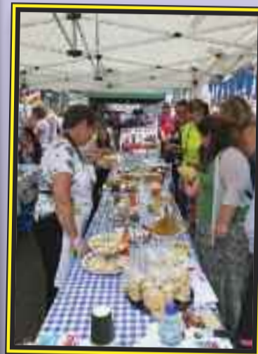
The home-made cakes on the Bake-Off stall were selling out fast.