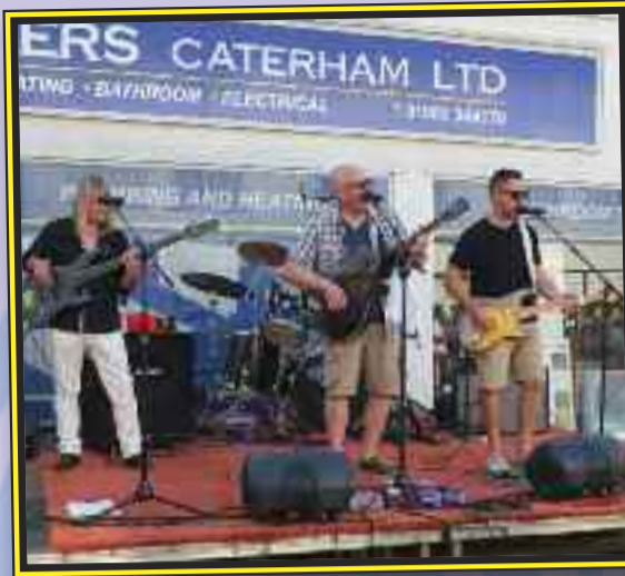
One of the live bands, "The Chase and Tail".