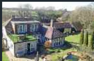
Five double bedroom executive home in a rural village setting. Sublime finish and specification SOUTH NUTFIELD £1,134,950