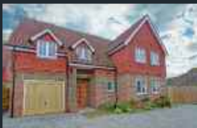
Superbly extended five bedroom three reception family home Greenvale primary (0.1mils) central London (31mins) SELSDON VALE £549,950