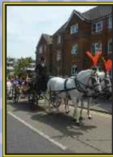
The Pinks Funeral Directors' carriage, supporting St. Catherine's Hospice.