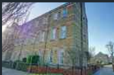
Extended three bedroom, delightful mature garden, open plan sitting room, garage, stylish kitchen. FORESTDALE £379,950