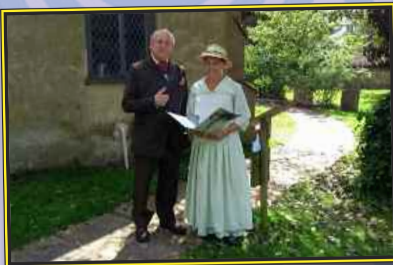
St. Lawrence's Church - another site on the poetry trail.