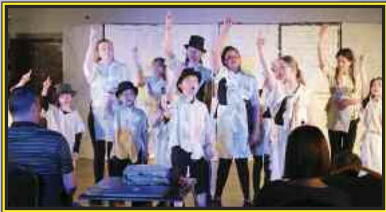
One of the "Inspiring Change" performances that took place at The Arc, celebrating a positive approach to mental health.