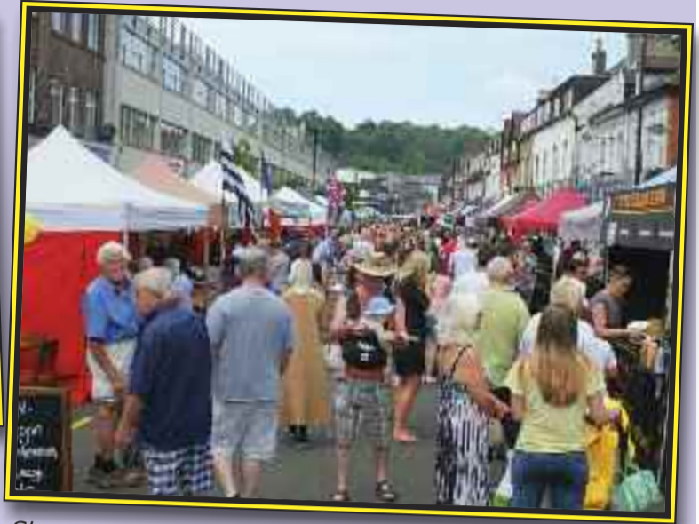
Shoppers pack Croydon Road to see what's on offer.