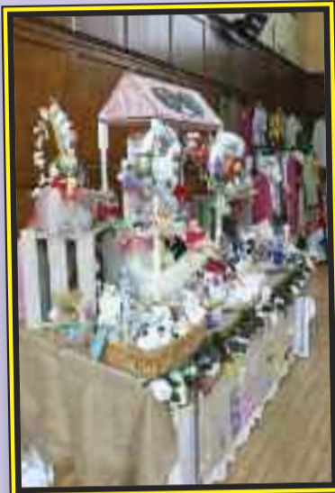
One of the beautiful craft stalls at the Soper Hall Summer Fair that took place on the same day.