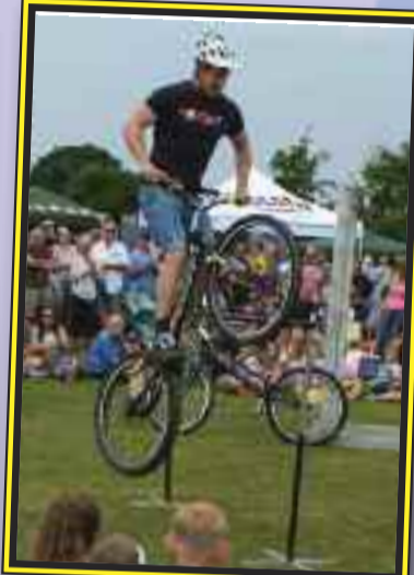
The arena display by 3Sixty Bicycle Stunt Team.