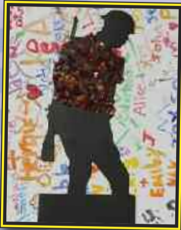
Soldier Silhouette.

One of the first events on this year's Caterham Festival calendar was the Street Party in the High Street. There were numerous attractions for all ages including free jelly and ice cream for the youngsters and a great line-up of live music from local bands.