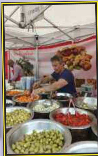
The colourful olive stall.