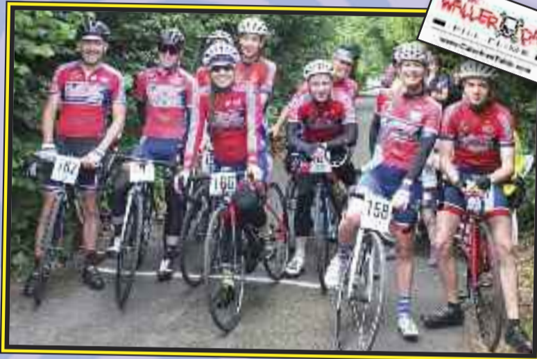
The "Velo Club Londres" team from Herne Hill, at the finish line after completing the race held on Sunday 17th June.