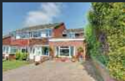
Nestled amongst ancient woodland in a 3/4 of an acre plot, four double beds, three bathrooms, three receptions, fabulous open plan kitchen/breakfast room, barn, double garage CHELSHAM COMMON £1,174,950