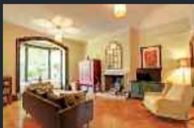
Historic three bedroom army barrack conversion, fabulous high ceilings, sash windows. Beautiful views. CATERHAM £549,950