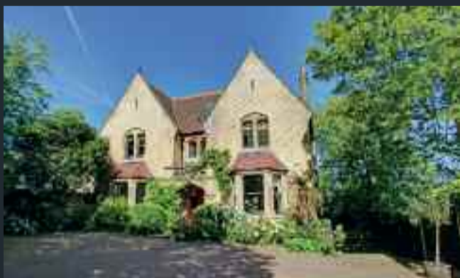
A remarkable five bedroom five bathroom detached home set in secluded grounds of 1/3 of an acre. Boasting magnificent period features and 19th century Gothic inspired architecture. Fantastic location CATERHAM £1,800,000