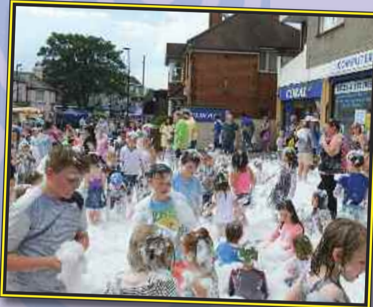
The crowd enjoying the foam finale to the party.