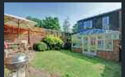
Five double bedroom executive home in a rural village setting. Sublime finish and specification SOUTH NUTFIELD £1,134,950