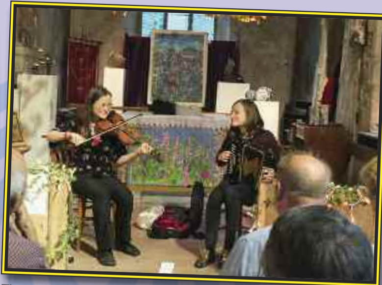
The Askew Sisters folk duo performing in St. Lawrence's Church.