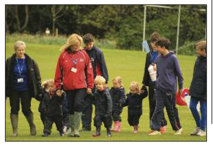
Teachers and pupils from The Hawthorns School taking part in the sponsored walk around the school grounds.

To find out more and to make a donation, visit www.hawthorns.com.