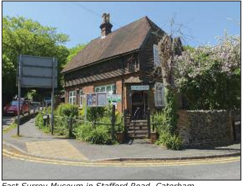
East Surrey Museum in Stafford Road, Caterham.

role interesting and over a period of time they would become a font of local knowledge!"