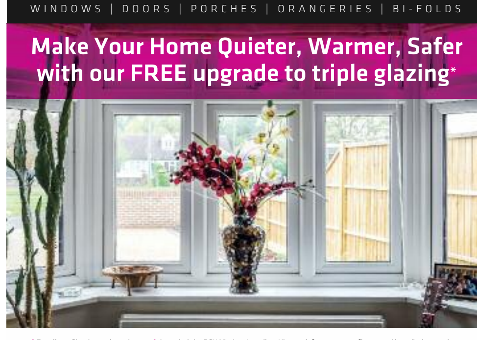
✓ Excellent Checkatrade ratings. ✓ Awarded the BSI Window Installers Kitemark for our expert fitters and installation service ✓ Members of the Age UK London Business Directory. ✓ An extensive range of colours and styles to suit your home. ✓ Products have high energy saving performance with highly rated security features.

If you would like to consider joining the group, please email caterhamrotary2@gmail.com.