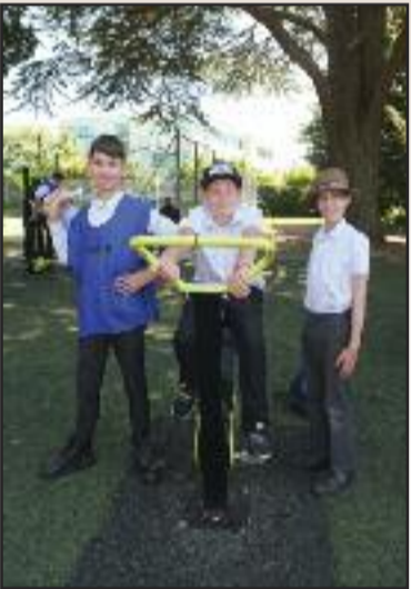
Students with one of the new pieces of gym equipment at Sunnydown.