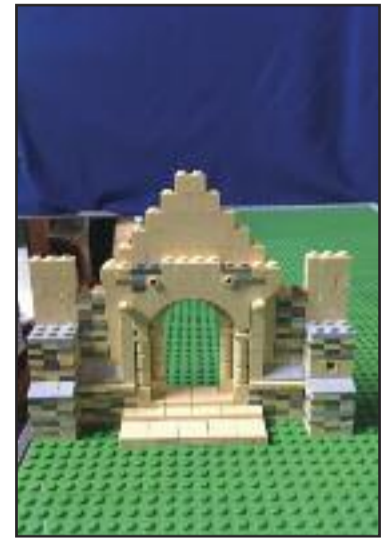
St. Mary's West Door taking shape in Lego.

The project is currently on display at the St. Lawrence's Church teas (3pm-5pm on Sundays until mid-September). From 15th September it will become a familiar site at local events starting with The Caterham Model Show (see What's On on page 21). Visit "Caterham Lego Church Build" on Facebook to watch the project grow and to help its progress.