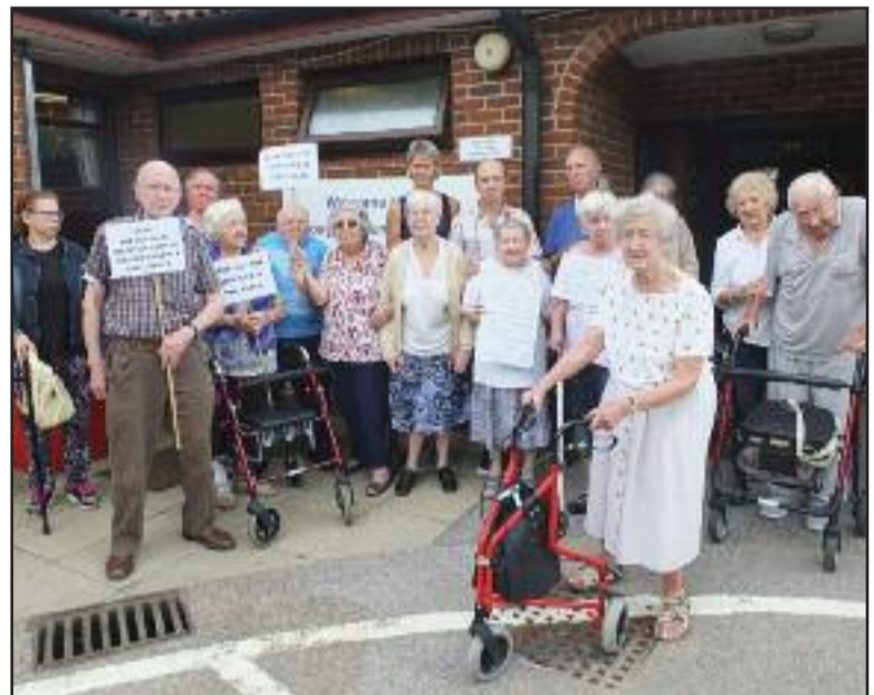
Members and Friends of the Douglas Brunton Centre protesting outside the Centre in Caterham.

There is one more chance to have your say over the draft Local Plan and its implications for the future of Caterham. Consultation ends on Monday 10th September - see page 3.