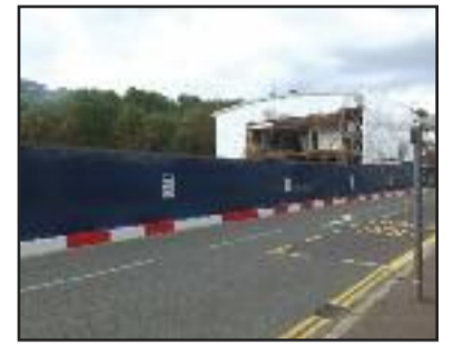
The site of the former Rose & Young garage in Croydon Road.

The affordable homes are expected to be ready by winter 2020 and will be available to purchase through shared ownership (part rent, part buy) aimed at first time buyers. Purchasers will buy part of the home and pay rent on the rest.