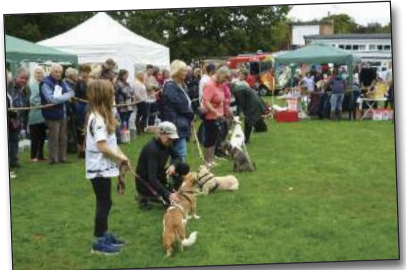
The Chaldon Fete Fun Dog Show.