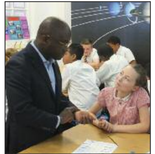
Sam Gyimah MP during his visit to Hillcroft Primary School this summer.

After the event, Sam Gyimah MP, who is the Government's Universities and Science Minister, said: "It's been fantastic to see pupils at Hillcroft School in Caterham having the opportunity to learn about science and understand how it is brought to life in the real world. The UK has a proud history of great scientific minds that have changed the world and initiatives like this run by STEM Learning and Pfizer can help inspire the next Sir Isaac Newton or Professor Stephen Hawking. It's crucial that we continue to support projects like this and help encourage young people