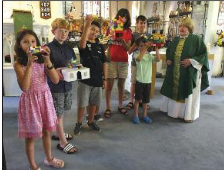
Youngsters with their Lego models at the launch of the project that took place in St. Mary's Church.