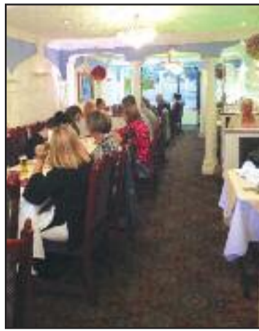
The busy restaurant interior.